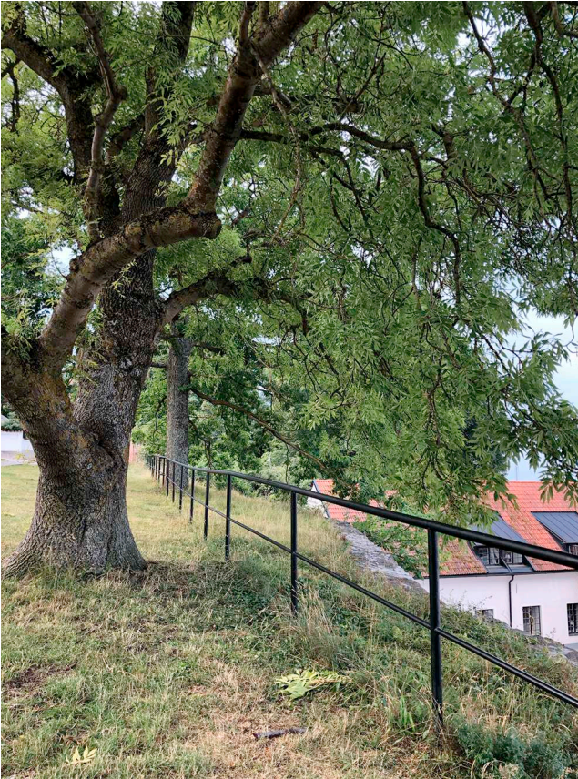
Figure 3.2 A small park in a stone city provides the opportunity for a moment of tranquillity with the city noise replaced by birdsong (Visby, Sweden).