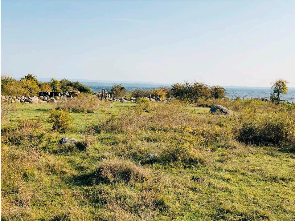
Figure 3.1 An example of a Natura 2000 Site of Community Importance in the county Scania, southern Sweden. A grassland with long-term management of grazing by the seaside, with high biodiversity in plants and insects, providing good conditions for many birds.