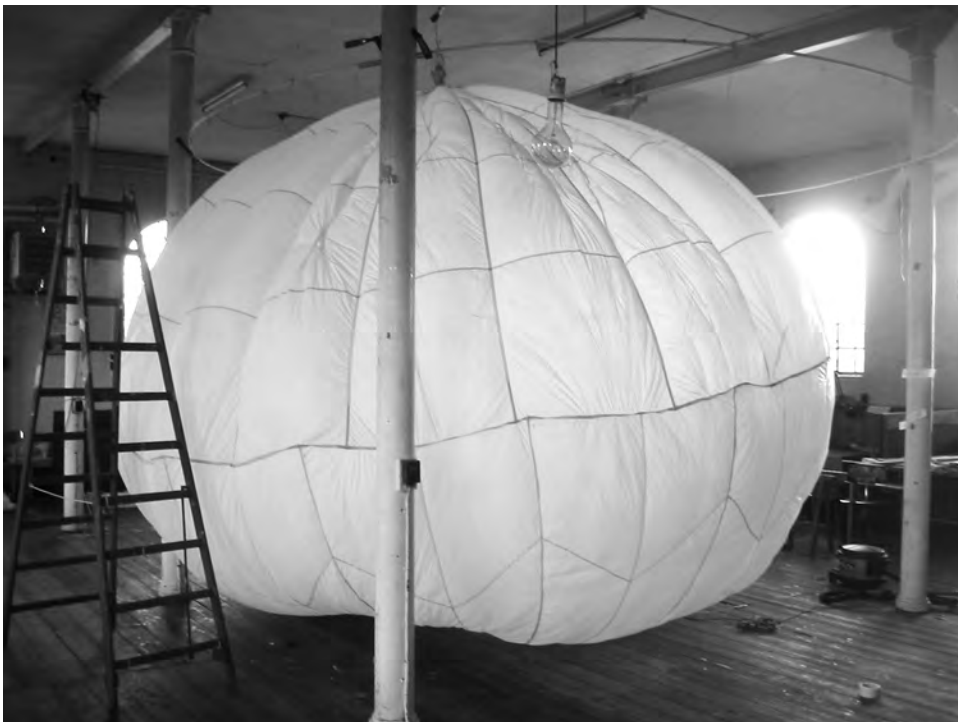
Figure 7.5 Medusae Nilfisk.

For the members, the score displays possessed potential for interactive installations with a certain “retro” aesthetic. Since the birth of Illutron in 2007, the diode displays, which together weigh more than a thousand kilograms, have been used in several installations—one at the Charlottenborg Museum of Art (in an interactive installation at the annual spring exhibition), one at the Roskilde Festival (in an interactive light