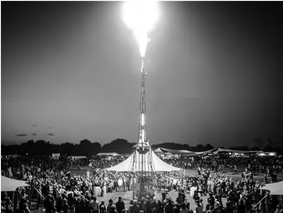
Figure 7.1 Explosion Village.

tank became the buffer tank for an interactive fire cannon. All the experiments were explored by imagining and testing the possibilities they might have in a context of playful participants in the field.