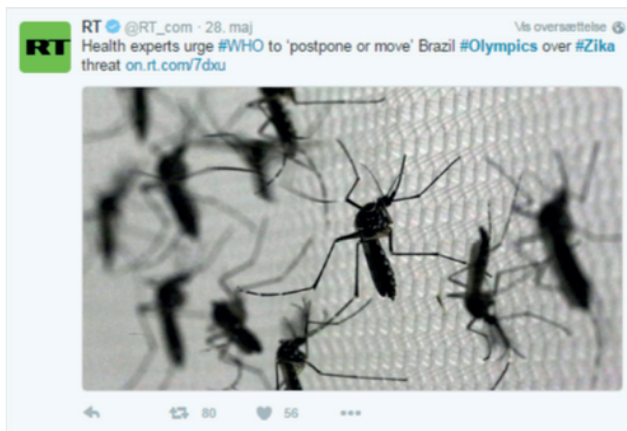
HISTORIE FRA TWITTER 1: Et tweet fra en gruppe sundhedseksperters, som opfordrede til, at De Olympiske Lege i Rio i 2016 enten blev flyttet eller udskudt, opnåede stor opmærksomhed på Twitter.

Lige siden de mere end 100 sundhedseksperters fra hele verden opfordrede WHO til at presse Den