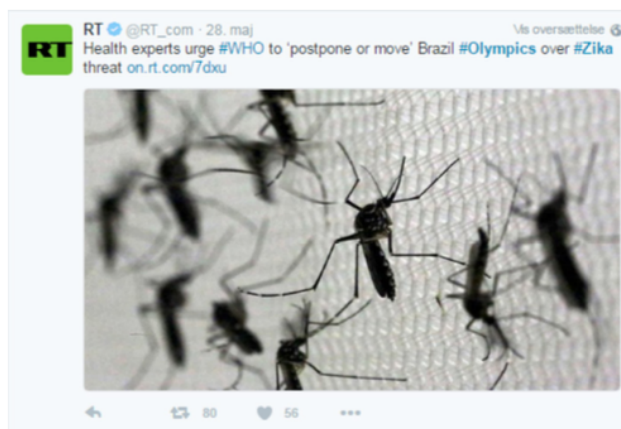
HISTORIE FRA TWITTER 1: Et tweet fra en gruppe sundhedseksperter, som opfordrede til, at De Olympiske Lege i Rio i 2016 enten blev flyttet eller udskudt, opnåede stor opmærksomhed på Twitter.

Lige siden de mere end 100 sundhedseksperter fra hele verden opfordrede WHO til at presse Den