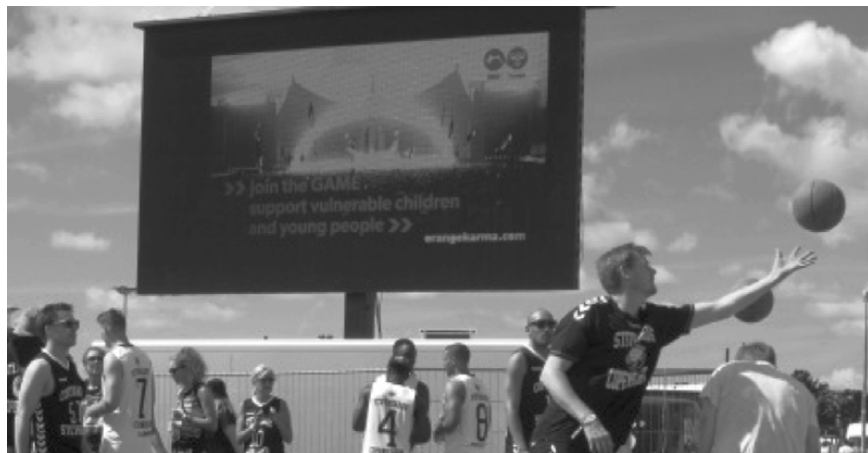
Figure 12.6 Screen showing GAME/Orange Karma promotion materials during basketball game 2015

GAME activities: a basketball event in Odense (Denmark's third largest city) and one in Copenhagen. The flyer, however, does not provide any information about what GAME is. I leave the Orange Karma area feeling more confused than when I arrived. 38