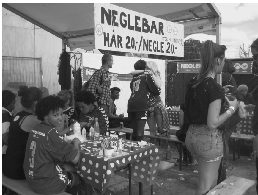
Figure 12.5 Orange Karma booth where festivalgoers and asylum-seekers can meet and talk during a nail or hair treatment

As indicated in the above quote, it is unusual for this kind of event to take place repeatedly at Roskilde Festival, and especially in such a prominent location. Usually