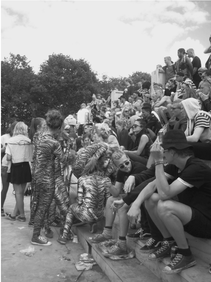
Figure 12.4 Spectators and participants in the Sensational Football tournament

... Two very different all-female teams now appear on the field: 'Team Kongelunden' and 'Team Jelling' – names of Danish asylum centres. They are different in the sense that they are wearing Hummel outfits and not fake noses or tiger tails. I hear some people from the crowd comment that they are probably very good at playing football. Six minutes later 'Team Kongelunden' has won the game and 'Team King Henrik's Harem' and 'Team Camp Tiger Kitten' enter the field. 31