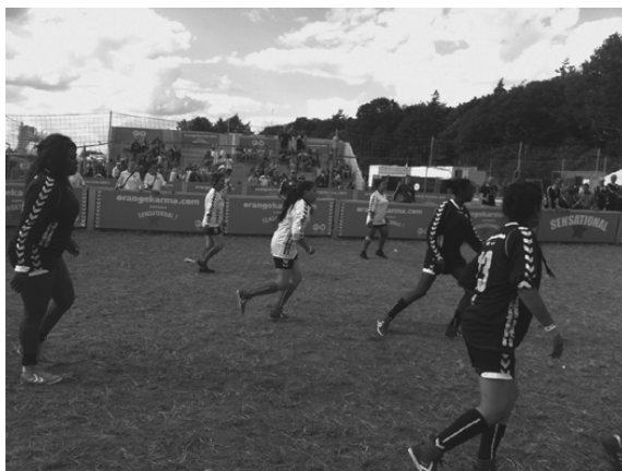
Figure 12.2 Sensational Football tournament at the Roskilde Festival

The main feature in Hummel's Orange Karma area in 2013 at Roskilde Festival was a twin football tournament that took place simultaneously. One tournament comprised teams of asylum-seekers, named after the different asylum centres, wearing matching Hummel gear (see figure 12.3). The other overlapping tournament was made up of ordinary female festival participants who signed up in teams that were more or less created for the event. Some had chosen a silly and festive theme and name for their team, such as 'Puzzy Riders' or 'Girl Power and Fishermen', whereas others had more commercial themes, such as team KitKat – a global candy bar brand – or team Cocio – a Danish chocolate beverage. 30 The teams wore outfits matching the themes (see figure 12.4). The festive front-page picture of Eir Soccer's website appears to be from a similar tournament of festive teams.