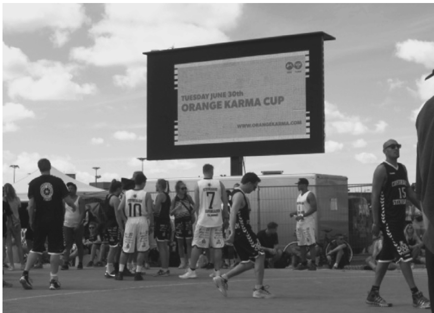
Figure 12.7 Players warming up for the celebrity basketball game

has taken place, which highlighted the festive spirit. 39 Alongside these videos, the Hummel YouTube channel also presented documentaries on the young asylum-seekers participating in the tournament. These depict the daily struggle of being refugees in Denmark, how the young people came to live in the asylum centres and the various ways in which the football teams provide a free space where their daily troubles could be forgotten and a sense of community and belonging could be experienced. 40