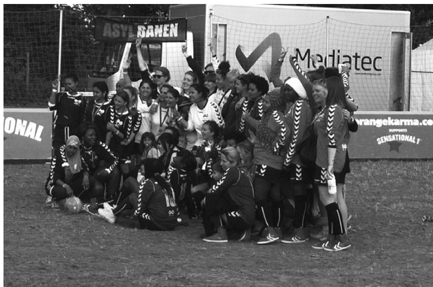
Figure 12.3 Participants in the Sensational Football tournament