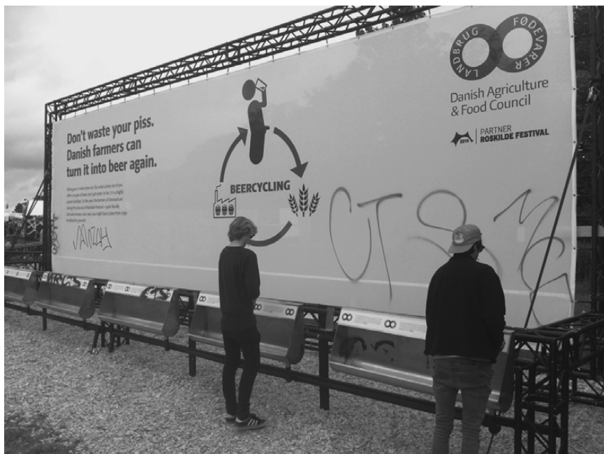
Figure 12.1 Collection of urine from the festival which Danish farmers will ‘turn into beer’

can work to either revitalise existent social power structures, or to motivate their transformation. 18