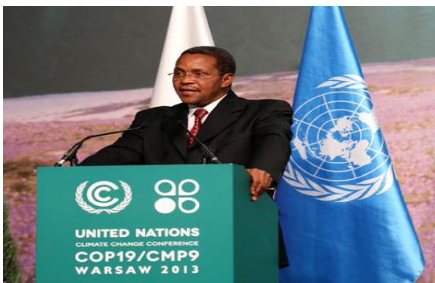
Figure 1.1. President Jakaya addressing the United Nation's annual climate conference (COP 19) in November 2013 in Warsaw, Poland.