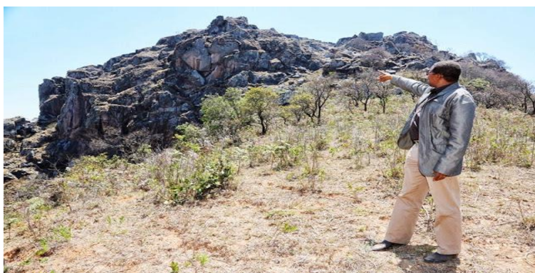
Figure 6.1. President Kikwete visiting NDC-run Liganga-Mchuchuma iron project in 2013