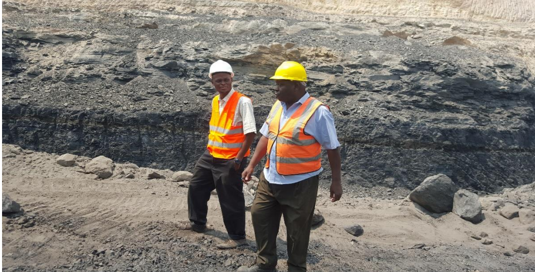
Figure 6.2 The researcher, accompanied by an NDC official, during fieldwork in Ngaka

The CHADEMA opposition and the local population therefore shared a strong sense of the challenges Tanzania was confronted with, despite expectations relating to future benefits and possibilities being high.