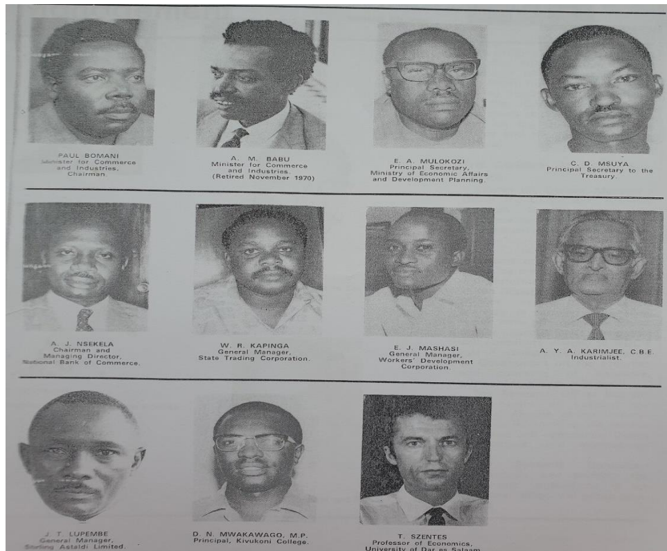
Figure 6.3, NDC Board of Directors, 1968-1970.

Source: author's archival research at NDC headquarters in Dar es Salaam.