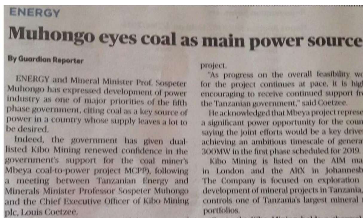
Figure 1.2 Guardian headline, 27 February 2016.