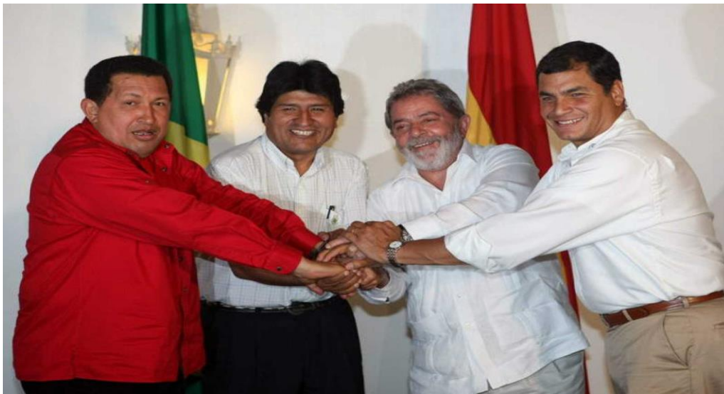
Figure 4.1. Hugo Chavez, Evo Morales, Luiz Lula da Silva and Rafael Correa in 2009