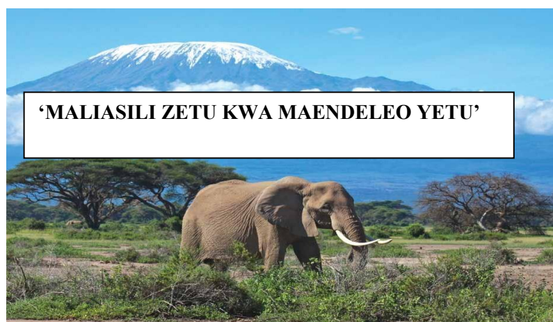
Figure 5.2. Photograph of CHADEMA’s election manifesto, with the slogan ‘Our natural resources for our development’.

Natural resource and mining related campaigns slogans were also part of the 2015 general election, as illustrated in Figure 5.2.