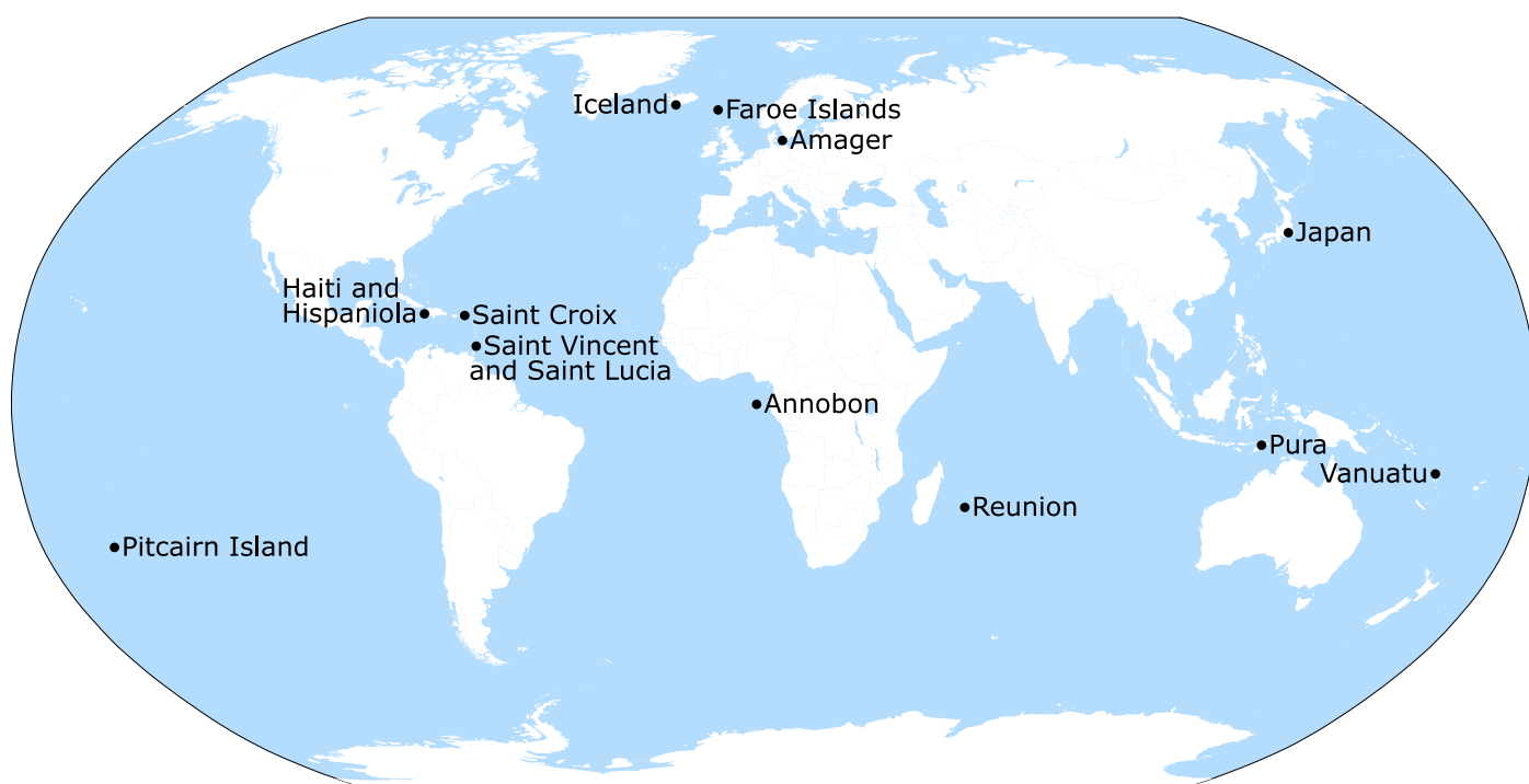
Figure 1: Map with approximate locations of the islands considered in the paper

The islands and archipelagos of which we have knowledge are hugely different from one another. Our sample is one of convenience, with no claim for representativeness. We have taken the following islands or archipelagos into consideration: Amager in and near Copenhagen, Denmark; Annobon in the Atlantic Ocean; the Faroe Islands in the Northern Atlantic Ocean; Haiti in the Caribbean Sea; Iceland close to the Arctic Circle in the Atlantic Ocean; Japan in East Asia; Pitcairn Island in the South Pacific; Reunion Island near Africa in the Indian Ocean; Pura Island in the Indonesian archipelago; Saint Croix in the Caribbean Sea; Saint Vincent and other islands of the Lesser Antilles in the Caribbean Sea, and the Vanuatu archipelago in the South Pacific. These islands and archipelagos are not only spread all over the globe, but the historical, social, and linguistic diversity they represent is vast.