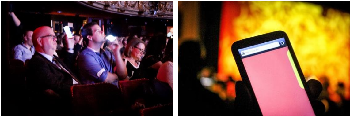
Figure 2. Audience members choose colours with their mobile phone (Photography by Peter Løvschall).