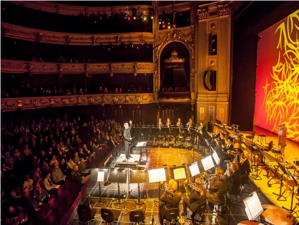
Figure 1. Audience controlling the backdrop with the installation In Case of Emotion . (Photography by Mads Hoby).