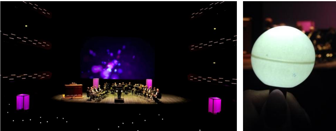
Figure 3. Audience members trigger bubbles on the screen. (Photography from Ranten & Jensen 32 ).