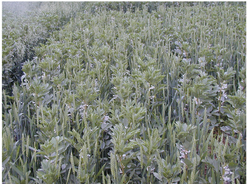
Fig. 1 Intercrop of spring wheat ( Triticum aestivum L.) and faba bean ( Vicia faba L.).