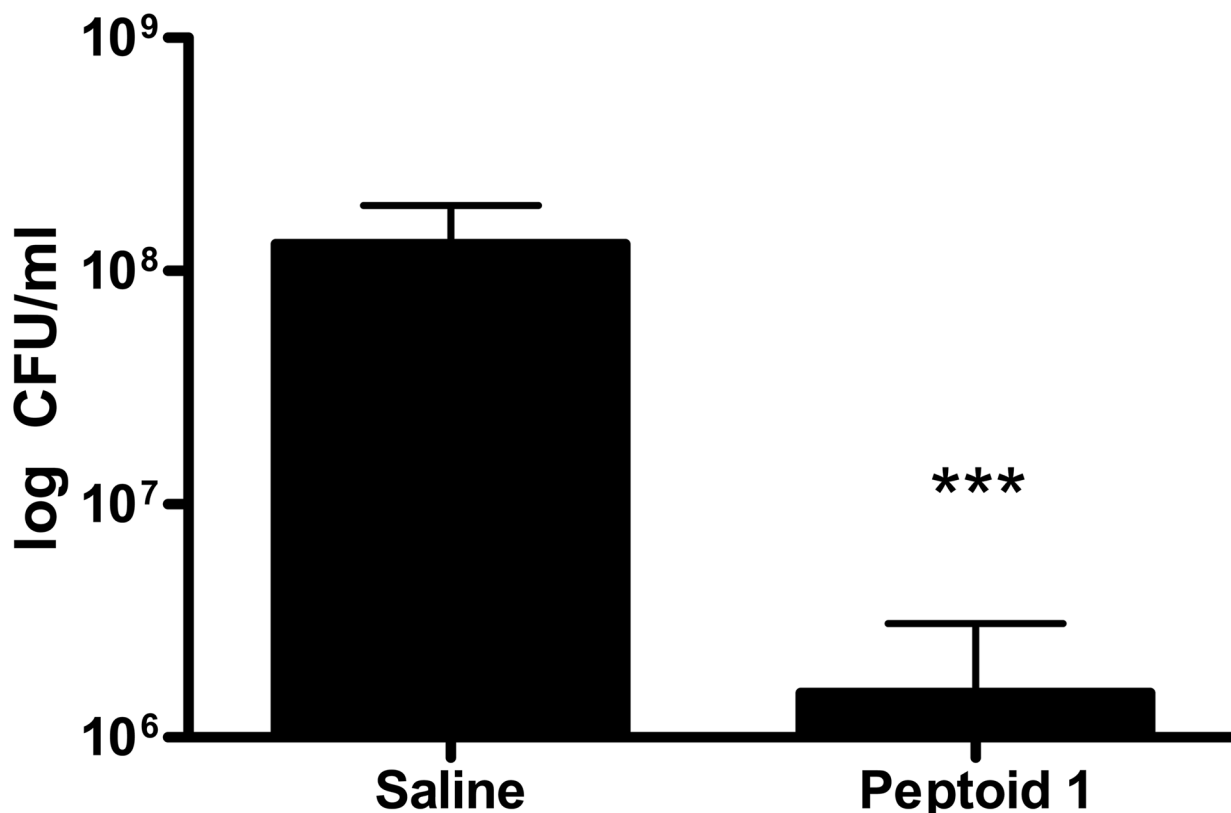
Fig 3. In vivo efficacy of peptoid 1. Four hours after intraperitoneal i.p. challenge with methicillin susceptible S. aureus , peptoid 1 was administered locally at a concentration of 4 mg/kg. Colony forming units (CFU) in the peritoneal lavage fluid from individual mice (plated in duplicate) at 24 hours are shown in the vehicle (saline) and peptoid 1 treatment groups. The graph indicates the geometric mean of each group. Dead animals at 24 hours were assigned the highest colony count observed in the experiment. *** indicates P < 0.0001 by contingency Chi-square analysis, with a confidence interval of 99%.