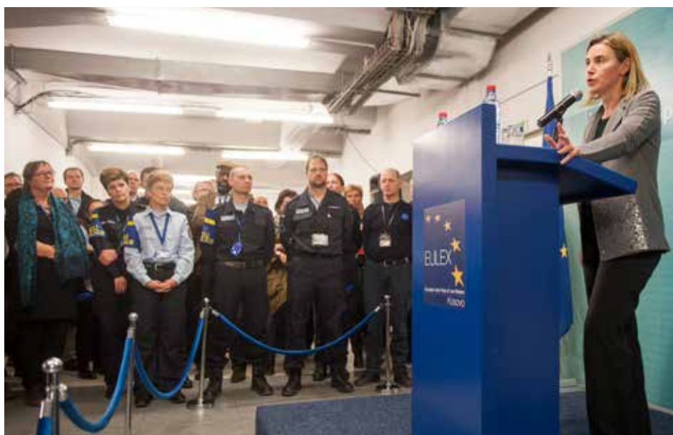
Right: Federica Mogherini visit to EULEX Kosovo