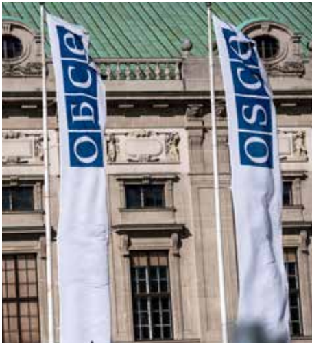
Top: UN Secretary-General Holds Meeting With UN Logistics Office Staff, 2007