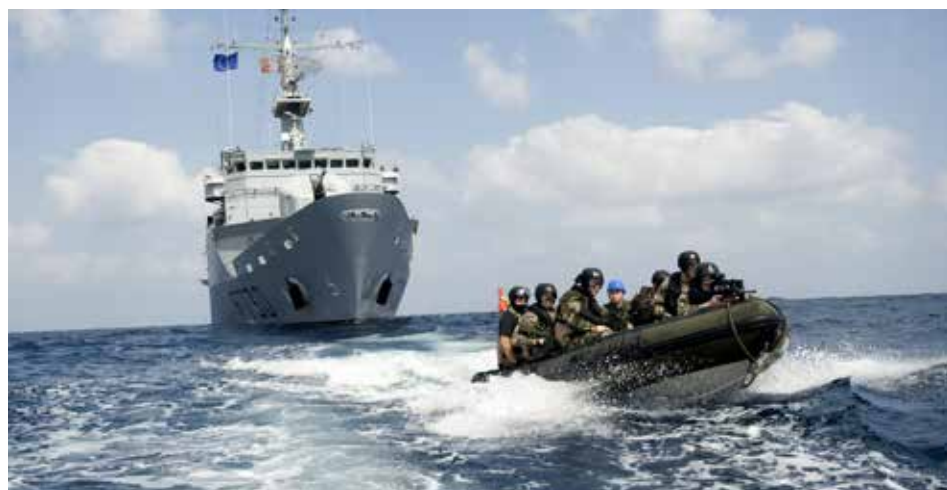
Left: Rescue operation