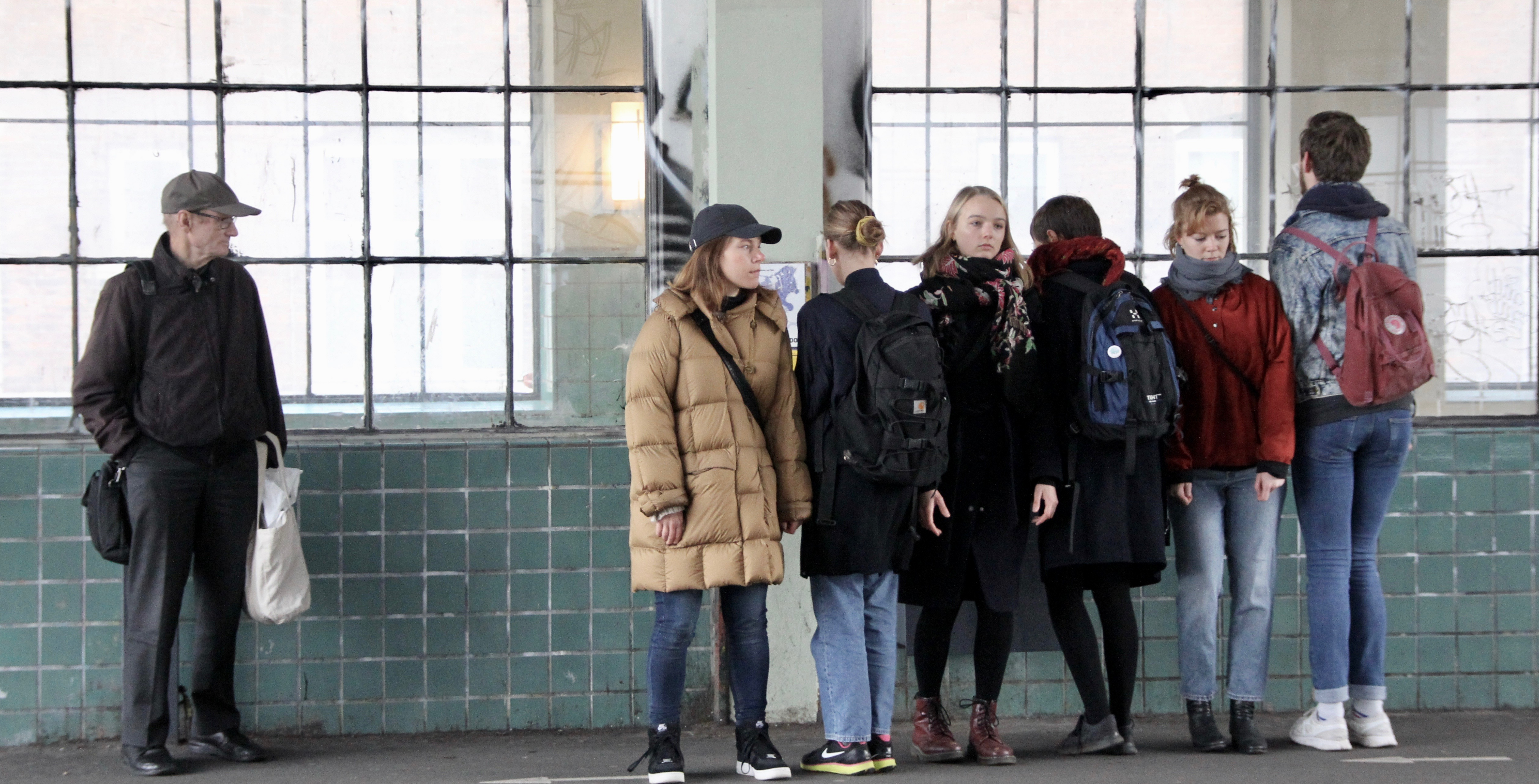
“The emergence of a collective body” autumn 2017