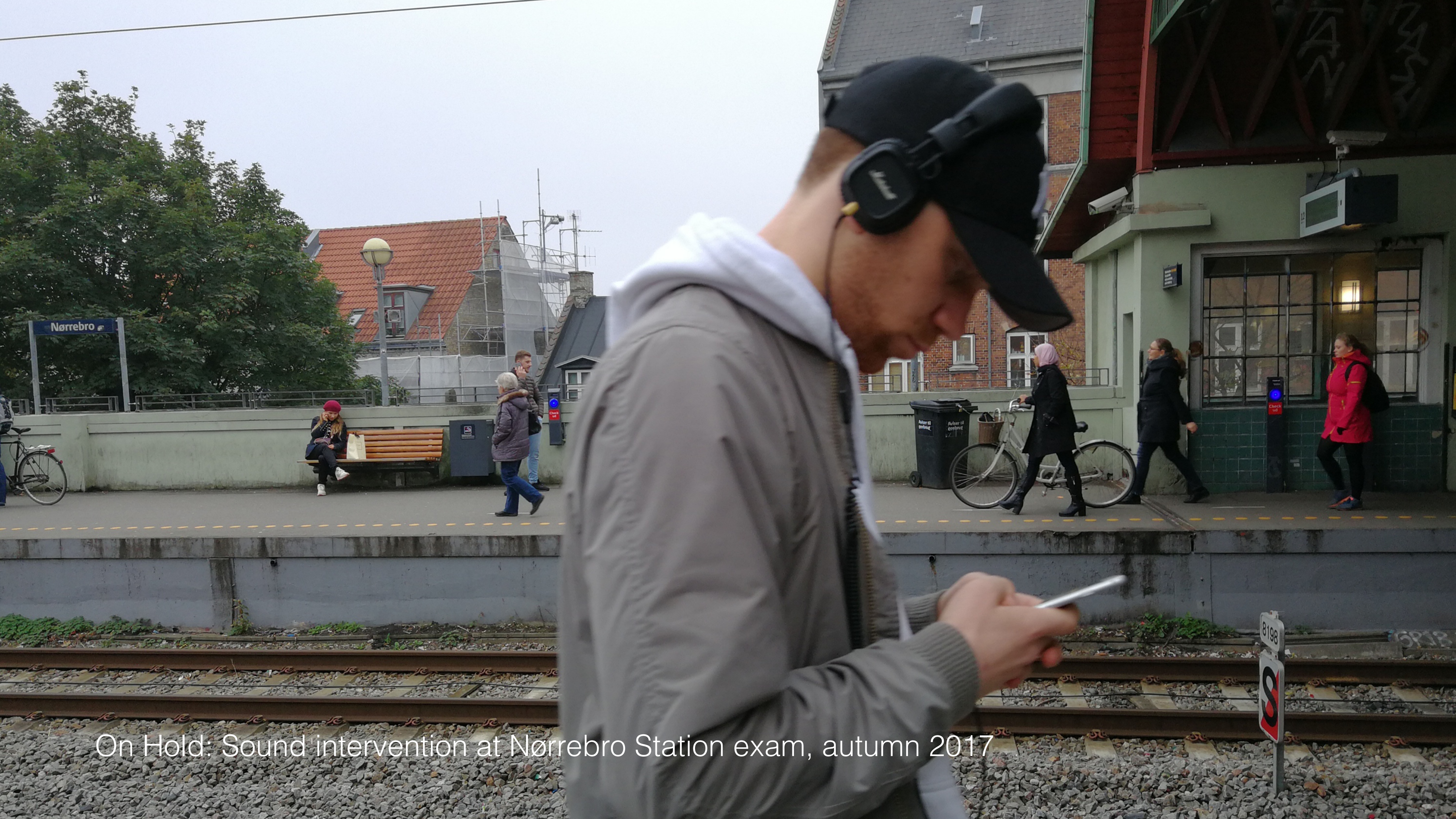
On Hold: Sound intervention at Nørrebro Station exam, autumn 2017