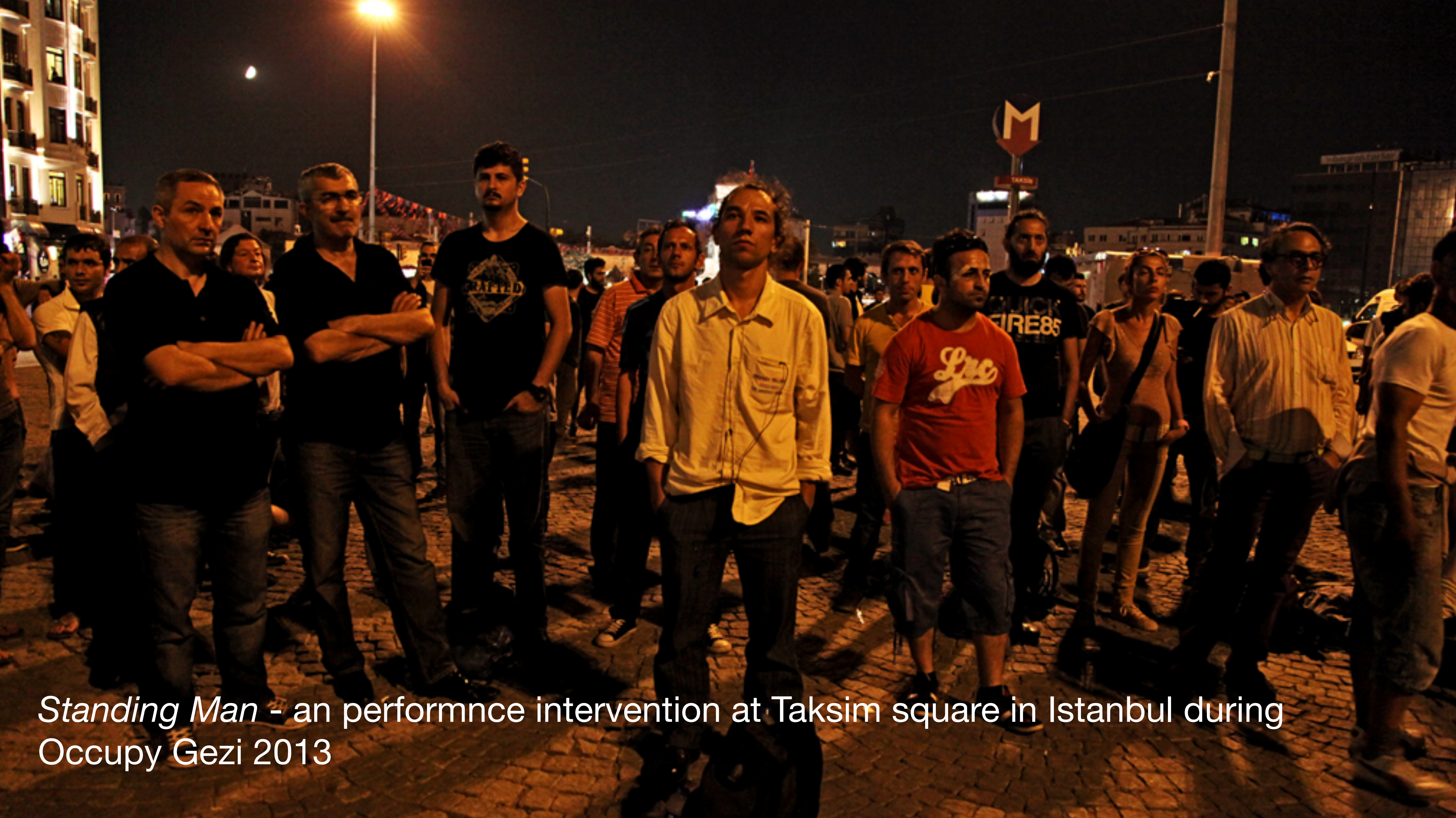
Standing Man - an performnce intervention at Taksim square in Istanbul during Occupy Gezi 2013