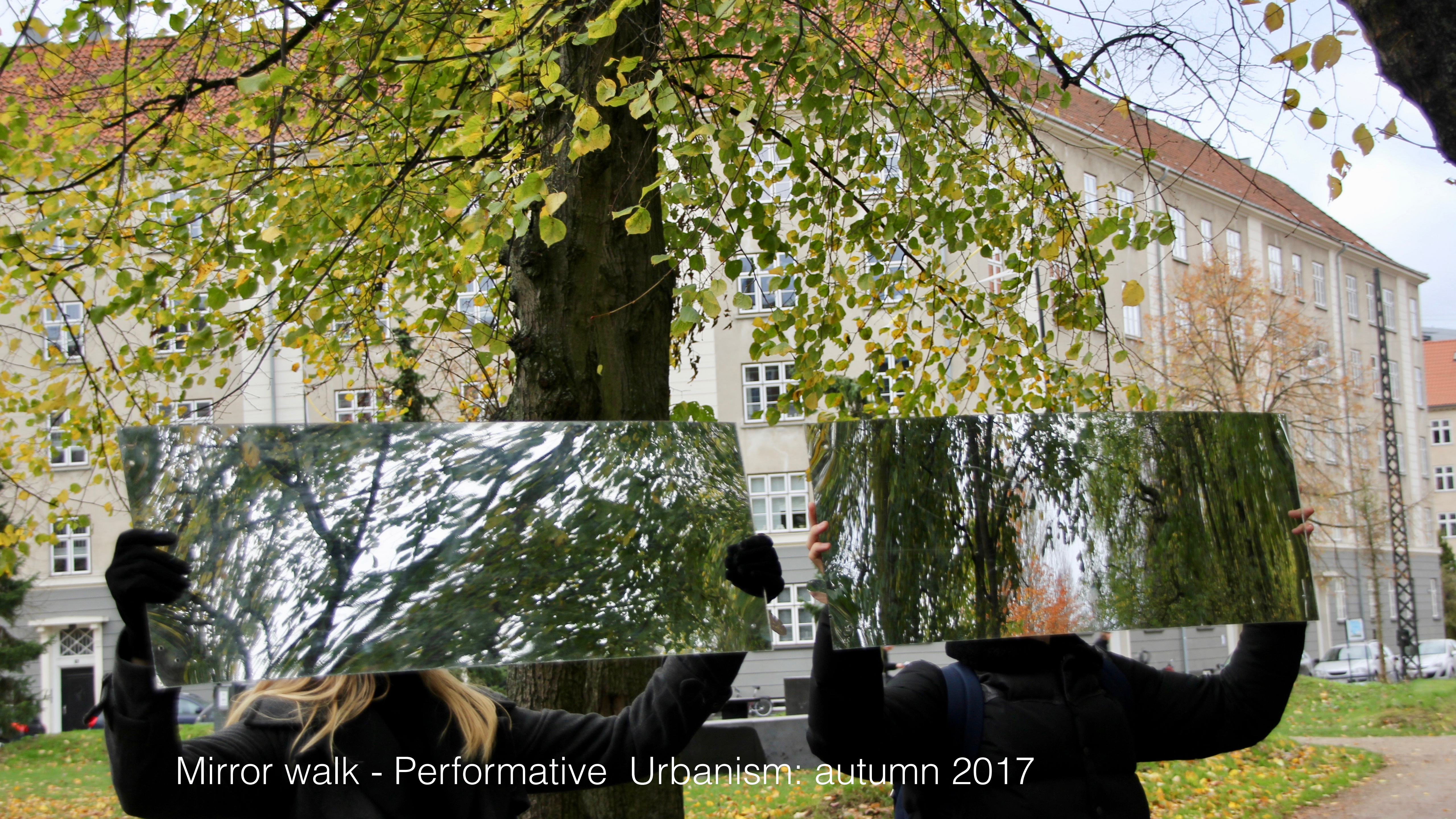
Mirror walk - Performative Urbanism: autumn 2017