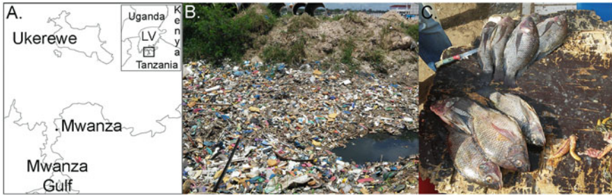
Fig. 2 Map of the Lake Victoria study area showing the Mwanza region. (a) Nile perch and Nile tilapia were purchased from the harbor market at Mwanza (regional capital). The local fishing area extends across the Mwanza Gulf and to Ukerewe Island. Inset Lake Victoria (LV) bordered by Uganda, Kenya, and Tanzania. The Mwanza region located on the southern shore of Lake Victoria is highlighted. (b) Urban waste in Mwanza, including plastic debris, collects in drainage ditches which are a potential source of plastic pollution in Lake Victoria. (c) Nile Tilapia used in this study (photographed prior to dissection) were purchased from the market

( Oreochromis variabilis ) and Singidia tilapia ( Oreochromis esculentus ), which subsequently disappeared from parts of the lake [49, 50]. Thus Nile perch and Nile tilapia have established themselves as dominant commercial and ecological species and therefore represent logical choices by which to monitor MP pollution in the area. Moreover, their differing feeding habits could provide additional information by which to contextualize plastic ingestion. Nile perch are predatory fish feeding on haplochromine cichlids and gastropod snails, whereas Nile tilapia are omnivorous with a diet consisting of plankton and fish.