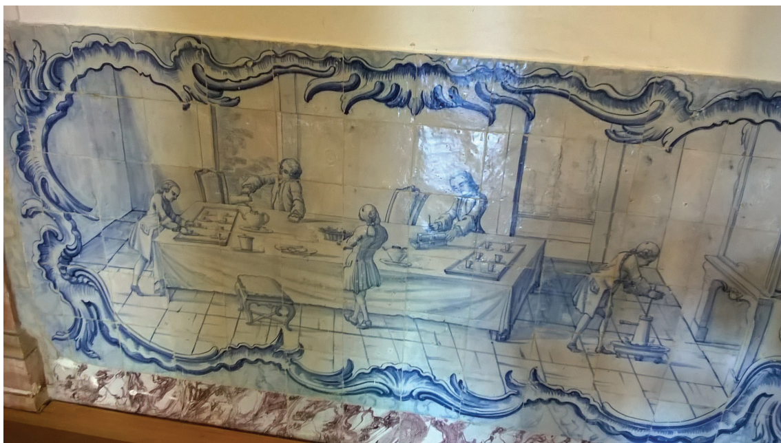
Figure 4: Tiles depicting 18th-century exotic beverages served in the Dining Hall.

fate. The already known as Marquis of Pombal was sent into exile to the namesake territory in central Portugal, but in the 1830s the victory of liberal principles would praise his reforms. By the early-20 th century his offspring sold Oeiras' estate to Artur Brandão, a businessman who split it into three sections before selling them. For decades the silhouette of the mighty palace resembled a ghost of Ages past in the quiet panorama of the downtown area, until the early-21 st century. Decades of mismanagement took its toll on palace and gardens, hence the continuous renovation works at hand, especially considering the "many tile panels from different periods of the 18 th century and of great artistic and historical quality that presented several frailties and pathologies (...). Therefore, to preserve (...) is to carefully save and maintain in good condition our heritage". (Fernandes, 2016: 41)