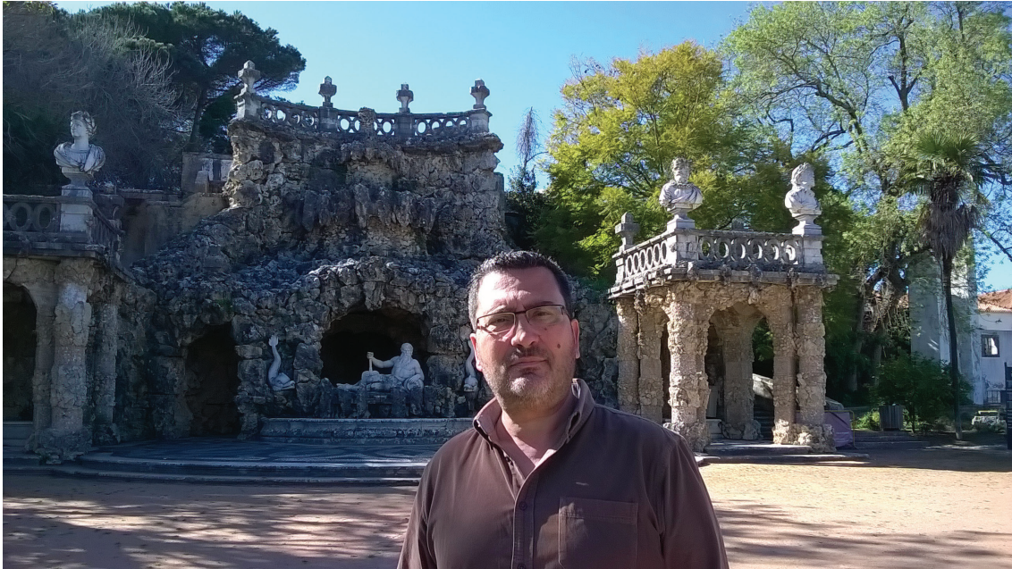
Figure 5: One of the authors'/Guides near the Classical Poets' Cascade.

sold at the palace's souvenir shop from cloth dolls to miniature tea sets, and junior astronomy kits.