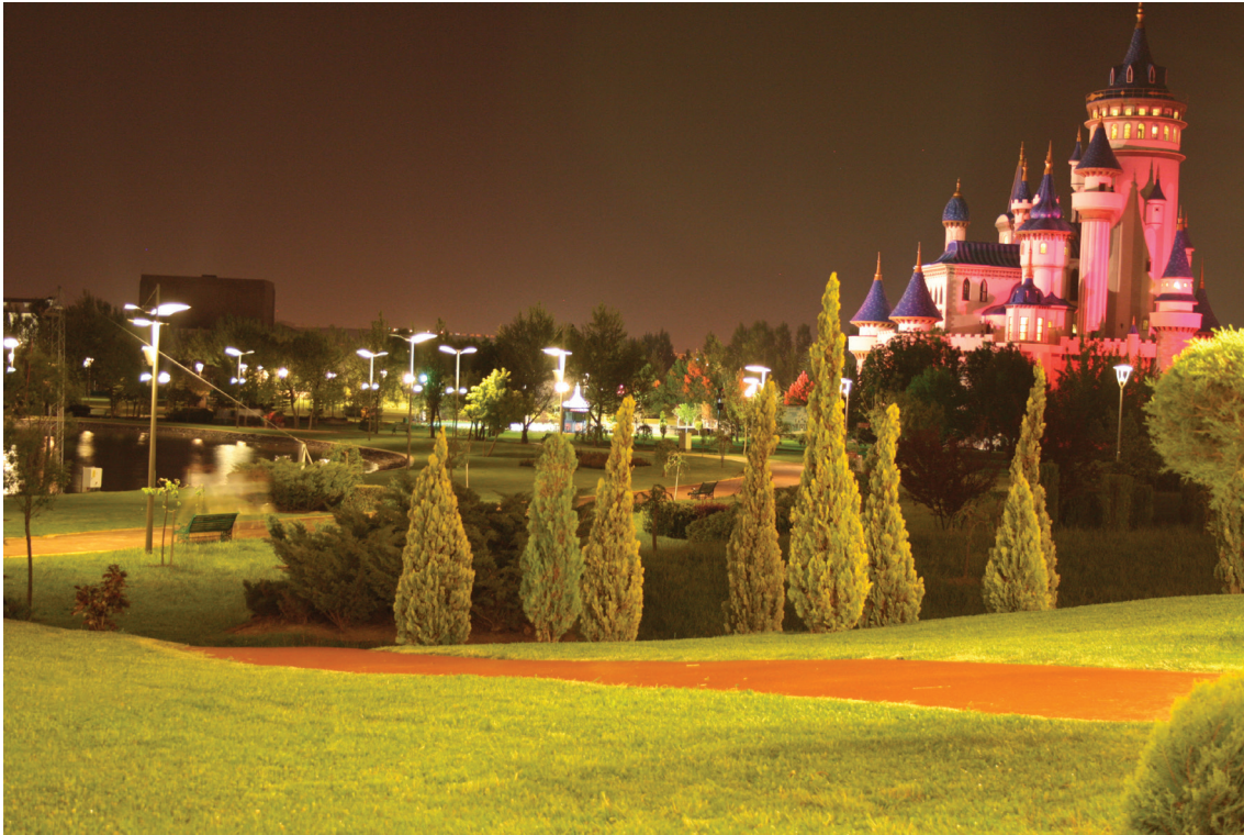
Figure 2: Eskişehir Science, Art and Culture Park.