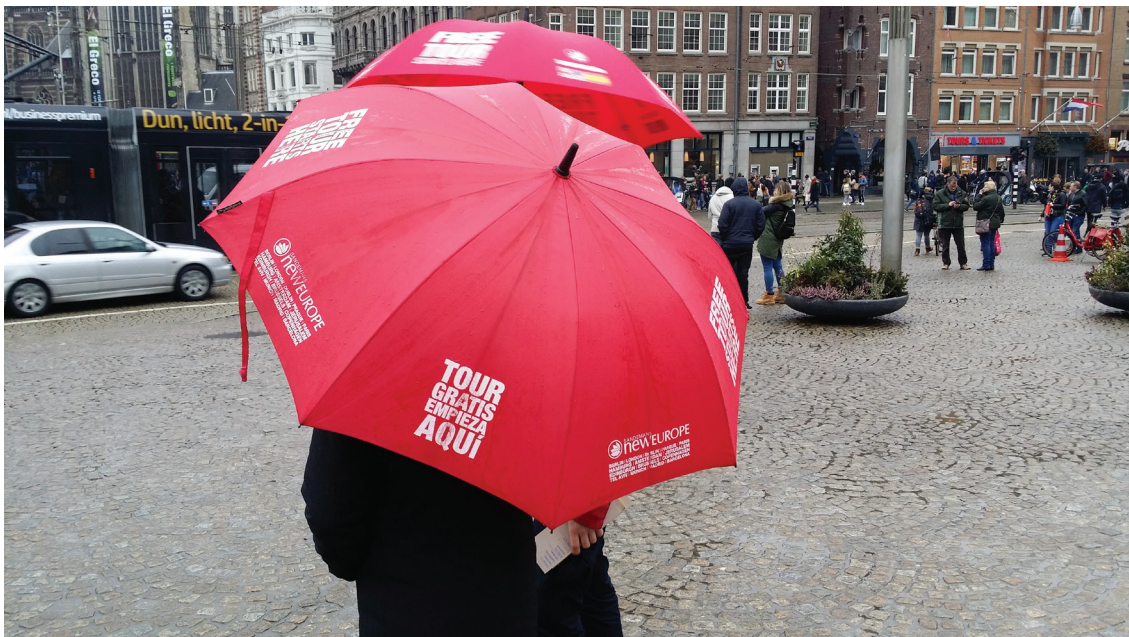
Figure 1: Sandeman New Europe.

The “free” walking tour phenomenon is contributing to the feeling of crowdedness and of being swamped with tourists in the city centre in a big way. On good days a hundred or more tourists gather at various times of the day on Dam Square, the departure point of most of the “free” tours (author’s observations). The many companies offering these walks try to make themselves known to their prospective customers with assorted colours of umbrellas, making for an often chaotic scene at departure times with orange (360Amsterdam), white (Free Walking Tours Amsterdam), yellow (FreeDamTours), blue (City Free Tour Amsterdam) and, the most well-known of all, Sandemans’ red umbrellas competing for attention.