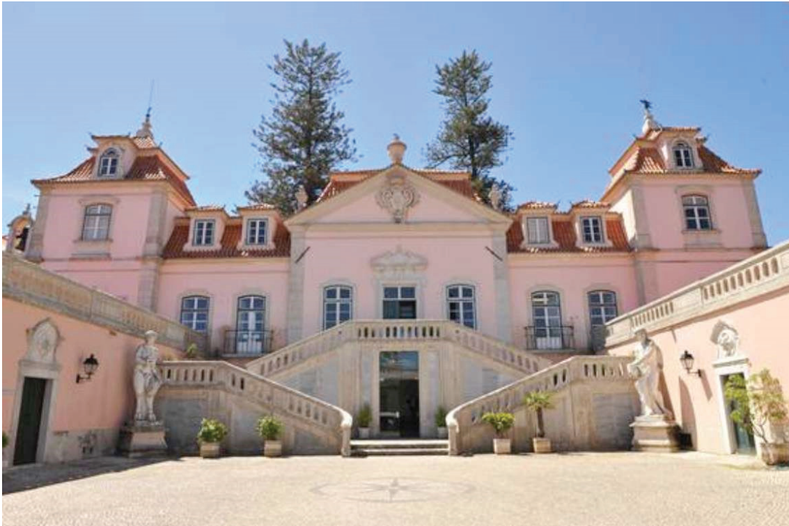
Figure 1: The elegant stairway that leads into Oeiras' palace.

a character, cultural practices and traditions. Many guides change their voice when they are telling a story as a simple way of dramatizing, while some tour operators hire volunteers or professional actors to perform a story or event. They sometimes perform a character themselves, or sometimes prefer to tell a story in the third person.