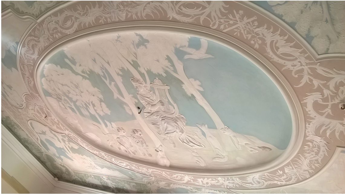
Figure 3: Orpheus playing the lyre that enchanted all creatures. (Authors' collection)

His cosmopolitan taste explains the naming of the Hungarian Karl Mardel as the architect for the estate that articulated productive and leisure areas, besides taking advantage of flowing brook and viewpoints that once allowed force lines, linking Sintra and Arrábida mountains. As Dias (1993) sustains, Mardel “was inspired by the landscapes of Vaux le Viconte and Versailles (...) and the philosophies of André Le Nôtre – grand architect of Louis XIV (...). Naturally Oeiras is smaller” (19). Other important artists included the Italian stucco master Giovanni Grossi, and the Portuguese (sculptor) Machado de Castro and (painter) André Gonçalves. Grossi’s stuccoes are everywhere: from the chapel to the Grand Hall, from intimate leisure spots like the Music Room (where lessons for the children and soirées for the family were organised) to Carvalho e Melo’s study (whose ceiling reveals Mercury flying over a building site, an allusion to Lisbon’s reconstruction works, but the guide might recall the Minister’s fine lacquered desk). Grossi’s artistry meets Castro’s skills in the Dining Hall, where the stuccoed groin vault is embellished with Carrara marble statues, besides Rococo glazed tiles with scenes of 18 th -century indoor and outdoor meals. There the guide might lead visitors to find the pannel were coffee and chocolate are being served, or the stucco cartouche where a servant wearing a turban waits on a lady.