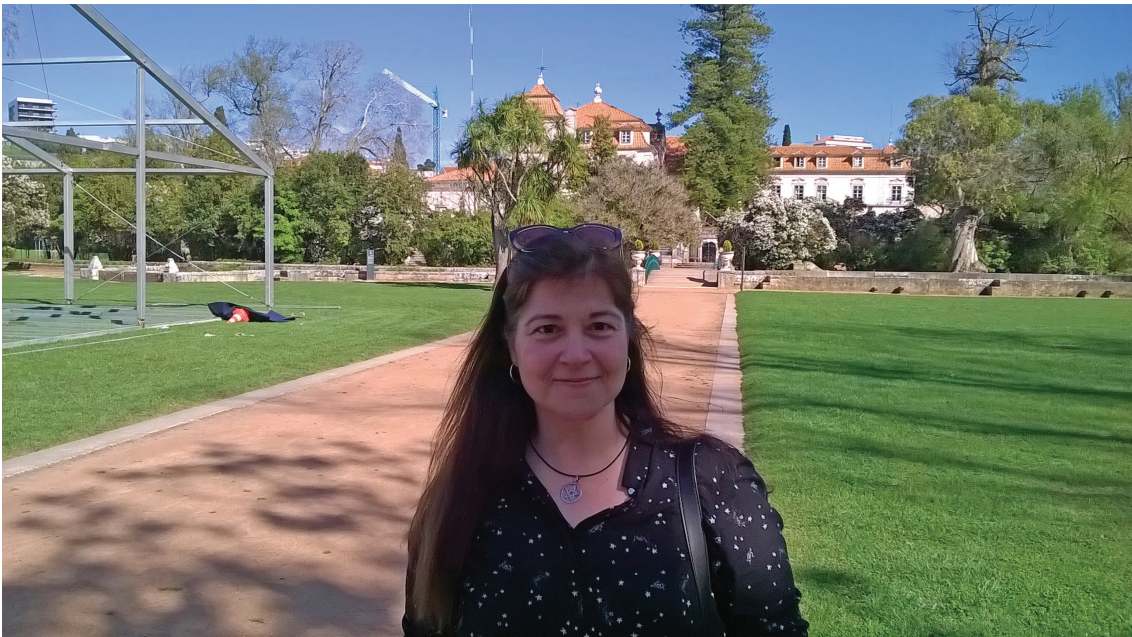
Figure 6: Another author/Guide interpreting the venue under mystical lenses.