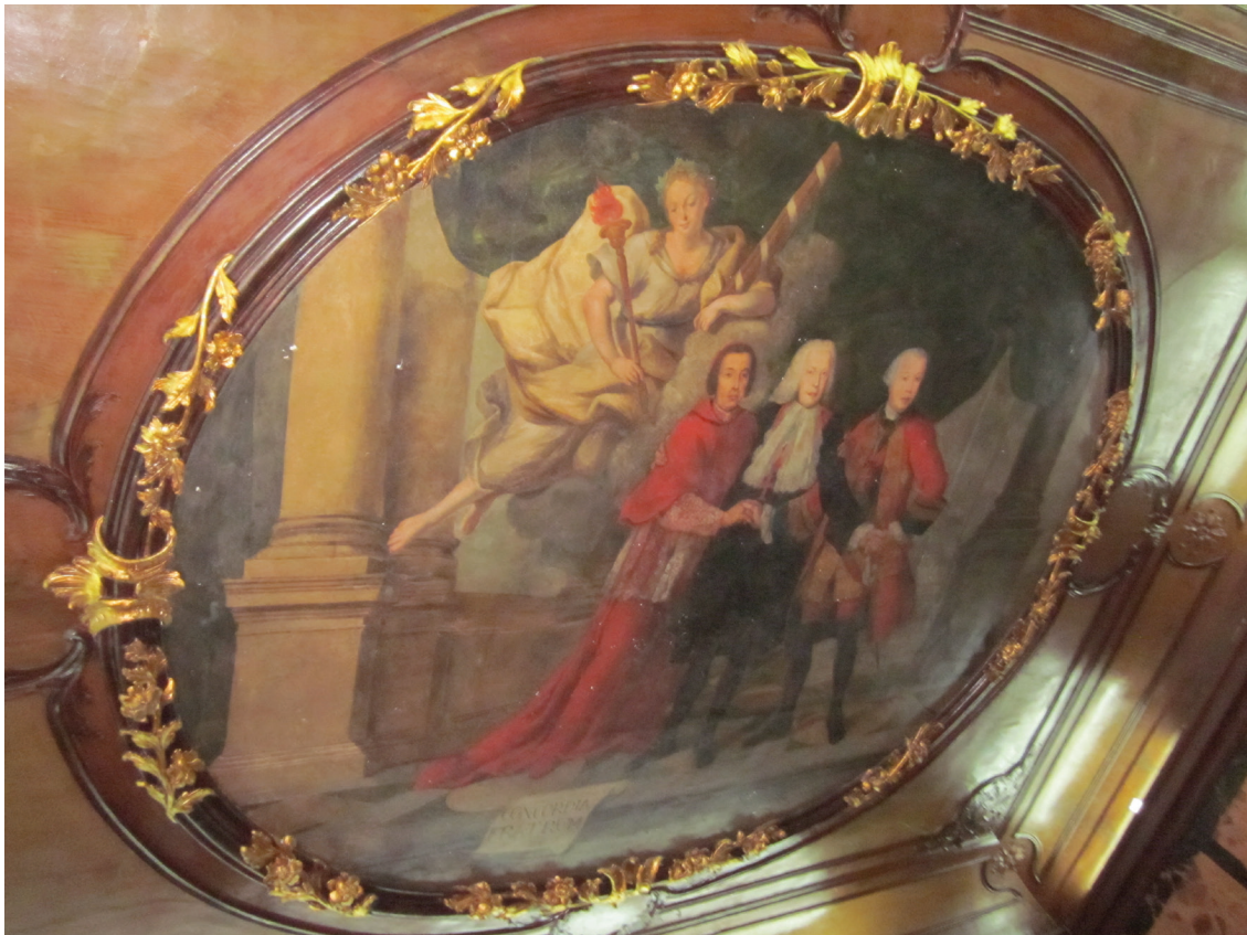
Figure 2: A ceiling embellished by the brothers' pact. (Authors' collection)

discreet farm set between the royal road to Lisbon and the coastline, with the Palace's initial section preserving its Baroque glazed tiles of battle scenes on the skirting boards of the Grand Hall. The room's current designation was granted after the building's enlargement, when the ceiling's stuccoed medallion with an allegory to Bounty (and Oeiras' lands) was added.