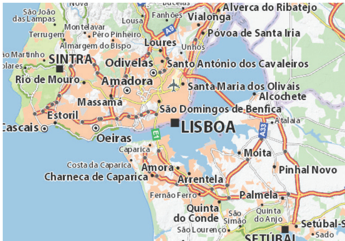
Map 1 Greater Lisbon (with international airport) and Oeiras' location. ( https://map.viamichelin.com/map/carte?map=viamichelin&z=10&lat=38.70701&lon=-9.13564&width=550&height=382&format=png&version=latest&layer=background&debug_pattern=.* )