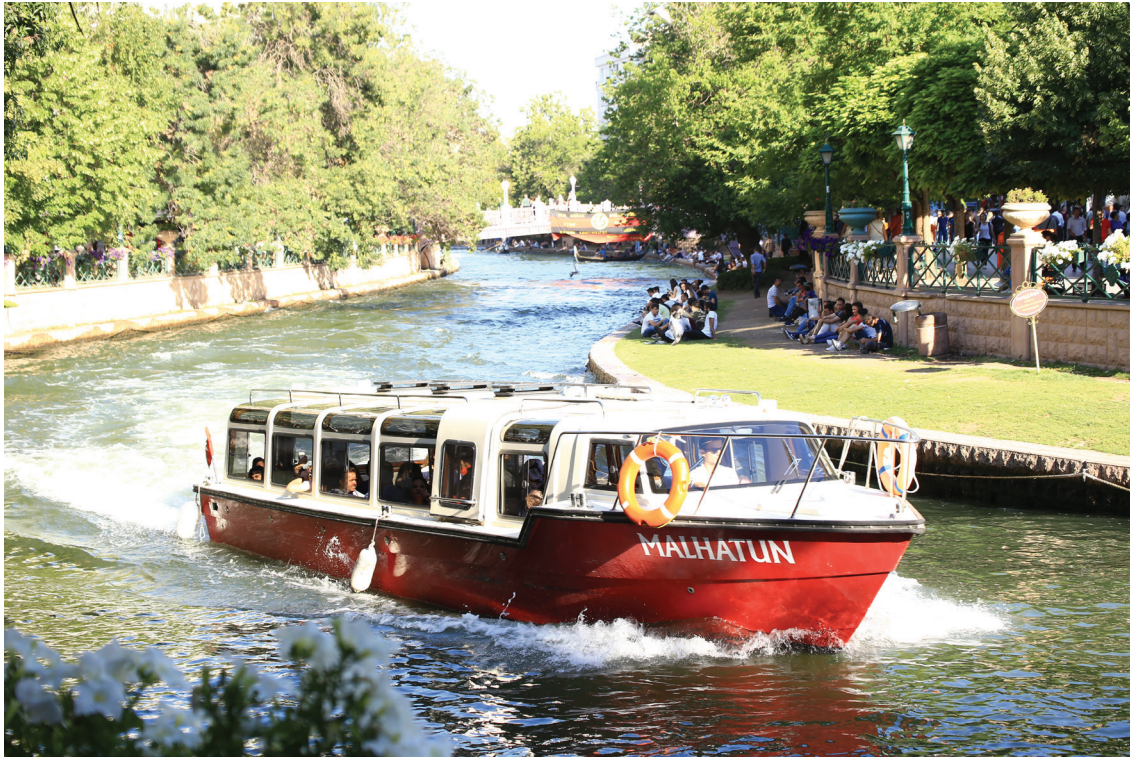
Figure 1: Boat tour on the Porsuk Creek in Eskişehir.

Eskişehir is one of the largest metropolitan regions of Turkey's territories on Asia (Anatolia). The city's historical background dates back to 4000 B.C. Eskişehir is represented as the city of thermal springs in many ancient scripts (İşcan, 2004). The Greek King Athenaios (200 A.D.) wrote: " The hot water springs found around Dorylaion are so delicious. " (Albek, 1991). The Arabian traveler Ali b. Ebu Bekir el-Herevi, who travelled around Anatolia in 1173, wrote that the thermal springs in Eskişehir had recuperating effects and that those springs were used both by the Turks and the Byzantines (Doğru, 1992). Evliya Çelebi mentioned the thermal springs of Eskişehir in his travel book, that he had written in 17 th century, and he stated that thermal water was good for renal calculus, gall bladder, gout, and skin diseases (Balcıoğulları, 2013, p. 300). In addition, the hot water around this region helps healing cardiovascular diseases, painful diseases, rheumatic diseases, inflammatory and traumatic neurological diseases, diabetes, obesity, gout, and renal calculus, and it also invigorates the skin (Banger, 2002, pp. 47-48).