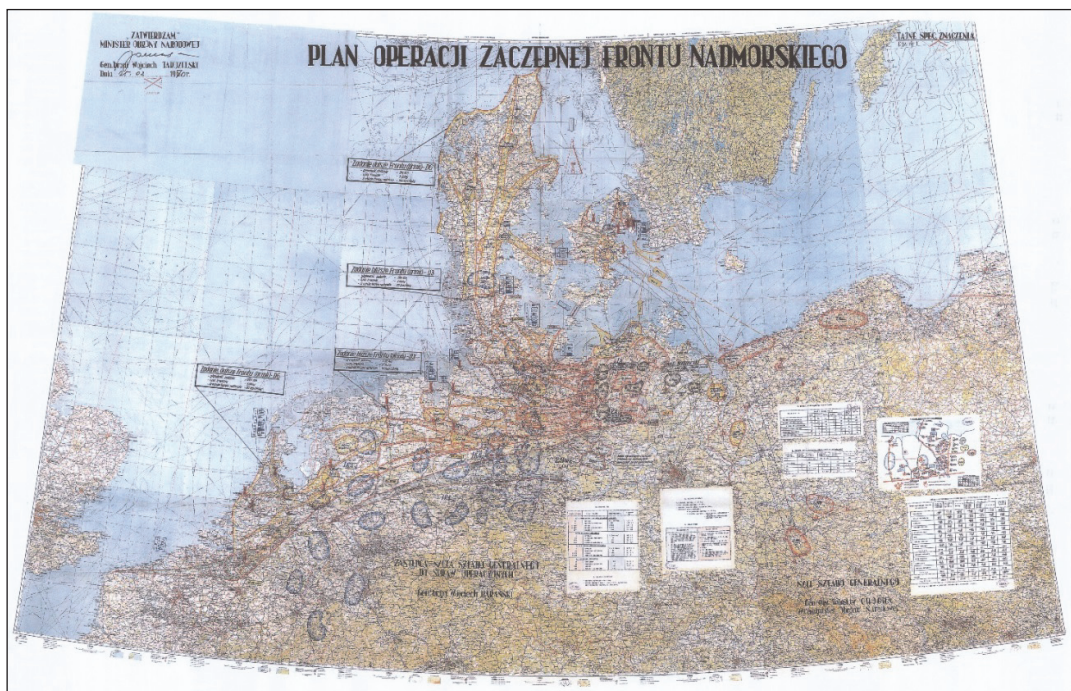
Figure 1. Plan of an Offensive Operation of the Coastal Front. The heading is quite clear, as well as the authorization of Defence Minister Jaruzelski (top left) on 25 February 1970. Classified as Tajne Spec Znaczenia , equivalent to NATO Cosmic Top Secret, the base map seems to be composed of a number of 1:500.000 map sheets, made by the Polish General Staff and based on Soviet maps.

The map itself is designed in a dramatic design language, with large red arrows pouring out of the right-hand, eastern, part of the map, cutting across Western Europe, unstoppable by forests, rivers and other natural obstacles and unaffected by major cities and political lines of division.