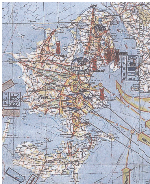
Figure 5. Detail of the map showing the final attack on Zealand and clearly illustrating the five nuclear warheads planned to be used in the final days of the operation.

Turning to the cartographic representation of the military forces and actions on the map, we notice that these draw on a specialized form of cartographic symbolization, used by military organizations to visualize military movement and actions. From a Danish perspective, the standard symbols used by NATO are probably the most known set of such symbols, as they have been used both by the Danish military as well as in numerous computer games and movies. However, the symbol used in the Polish attack plans were aligned to