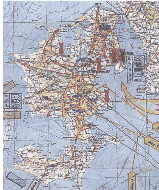
Figure 5. Detail of the map showing the final attack on Zealand and clearly illustrating the five nuclear warheads planned to be used in the final days of the operation.

Turning to the cartographic representation of the military forces and actions on the map, we notice that these draw on a specialized form of cartographic symbolization, used by military organizations to visualize military movement and actions. From a Danish perspective, the standard symbols used by NATO are probably the most known set of such symbols, as they have been used both by the Danish military as well as in numerous computer games and movies. However, the symbol used in the Polish attack plans were aligned to