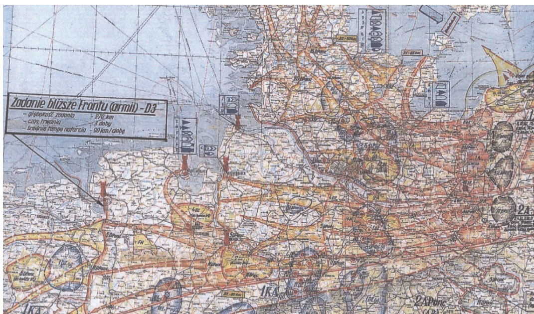
Figure 4. Detail of the map covering Northern Germany and parts of Holland showing the very precise use of time in the plan.

map concerns itself with the initial onslaught of day 1, which was planned to develop along the East-West German border and into northern Germany (see figure 4). Here we find very detailed planning, down to division level, with precise instructions concerning the deployment of tactical nuclear weapons, the relative position of infantry and armour and general directions of movement. As (plan) time goes by, the planning becomes less and less detailed and as the planning approaches day 5 and 6, it seems almost to be an expression of intent rather than actual planning. One exception to this is the attack on Zealand, which will be carried out on days 5 and 6 after the defeat of NATO forces in northern Germany, and in Jutland and on Funen in Denmark. Only then will 6th Airborne Division of the Polish forces be deployed together with the 15th landing division and a number of operational nuclear warheads in the final conquest of Denmark, which by this time is limited to Zealand and the operations of the Danish 1st and 2nd Zealand Brigade. Hence, time is not a gradual, linear progressing factor. Rather,