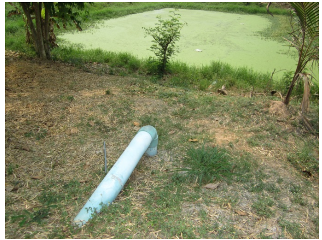
Fig. 4: Wastewater from the dairy in Tambon Ban Kor.

The data below is from interviews in Bangkok, from field trips to Pakchong and Tambon Ban Kor, where a napier grass expert and the dairy cattle farmers were visited respectively.