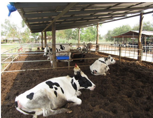
Fig. 1: Soil-flooring stable.

Half of the stables were designed with cement flooring and another half with soil flooring (hence no real flooring). The manure was piling up and the cattle's were walking in a 10-30 cm layer of manure (solid and slurry), as shown in Figure 1. When the manure reaches a certain level it is removed from the confinement area to the grass area just besides and dried in the sun, illustrated in Figure 2. All farmers sell dried manure to other local farmers in 15 kg bags at a cost of approximately 30 bath per bag (2,000 bath/tons). (Farm #1) As an example the total income from sale of 2.500 bags of manure added up to 75.450 bath on an annually basis.