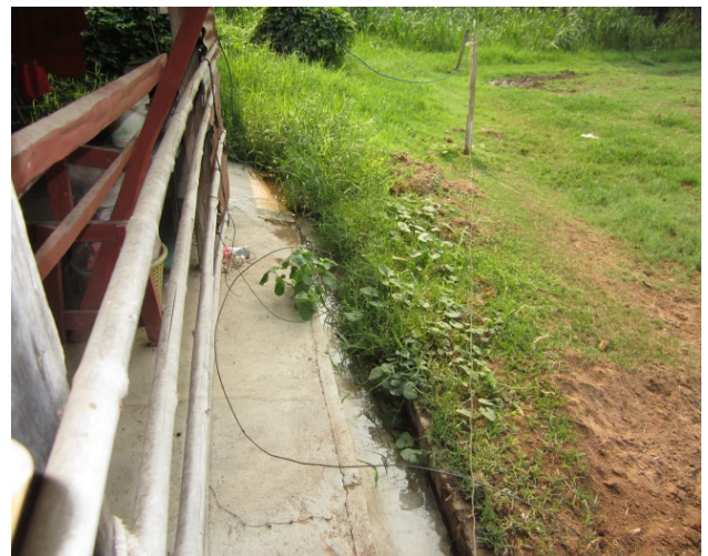
Fig. 3: Manure & cleaning water outlet.

Spill of slurry (liquids) to the surrounding environment in the confinement area, where the cattle's is situated, was observed, leading to possibly surface water and ground water contaminations. Also, spill of liquids (manure, cleaning water) from cleaning and milking the dairy cattle's, was observed. This wastewater is simply distributed in small outlet canals to the grass areas just besides the confinement area. See Figure 3 below.