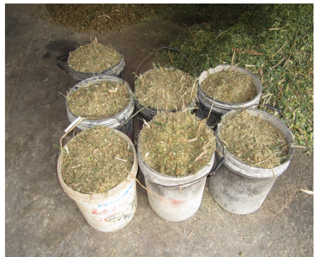
Fig. 5: Napier grass ready as livestock feed.

Napier grass (a sort of fast growing elephant grass) is relatively costly as animal feed compared to rice-straw, cassava-pulp and peel, if not grown on the farmer's own land [14]. Unless the production and harvesting is provided by highly commercial and technological advanced methods, which is slowly being deployed in Thailand [15], it will hardly be viably for biogas production (see Figure 5).