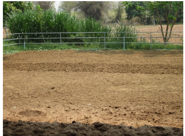
Fig. 2: Manure drying in sun.