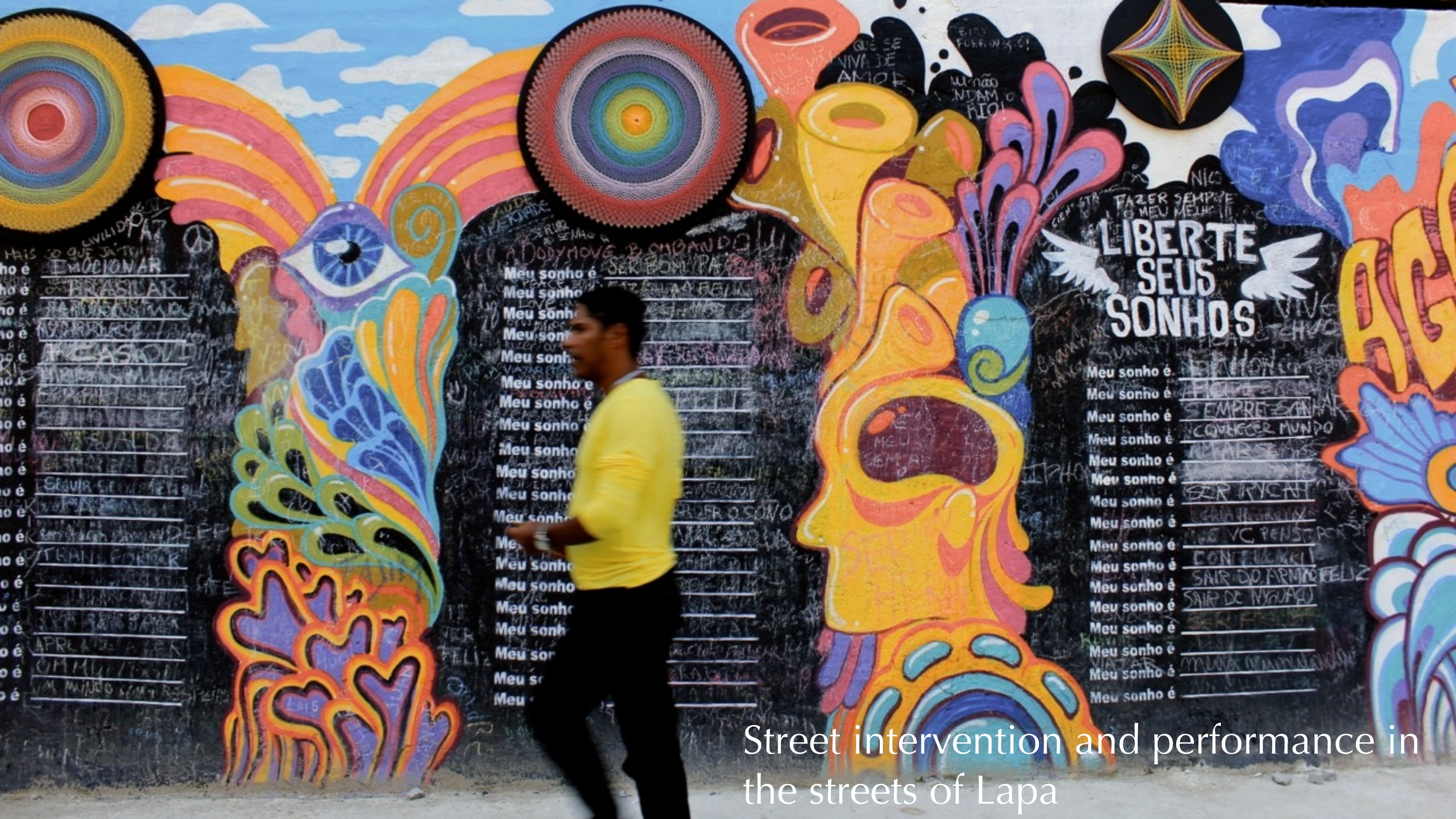
Street intervention and performance in the streets of Lapa