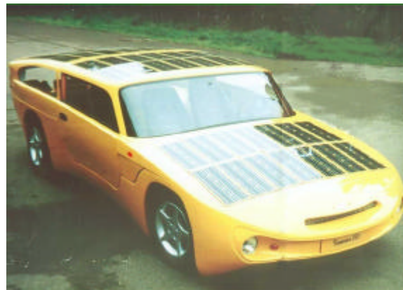
Figure 10 (below). "Connector 2001" hybrid solar cell-plant oil car (Torja, developed during mid-1990ies).