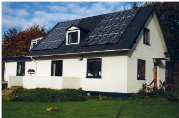
Figure 7 (above). Single family dwelling furnished with 4 kW c-Si PV panels as part of the Solar-300 project (Encon, 2000).