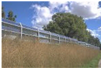
Figure 3 (left). PV panels mounted on road protection barrier at Fløng (NESA, built 1999).