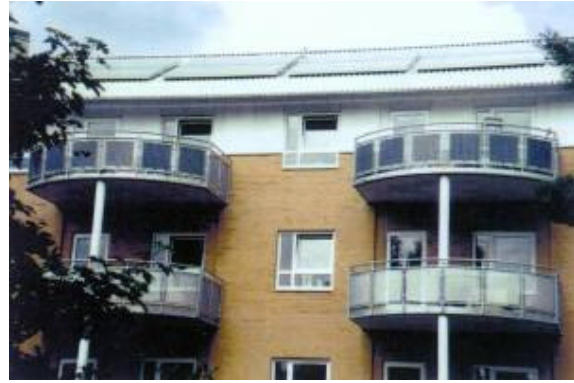
Figure 9 (above). Balcony PV retrofits in Herning (2kW c-Si, installed 1997).