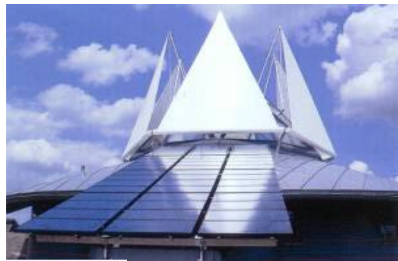
Figure 1 (above). Villa Vision at the Danish Technological Institute, Tåstrup (built 1993, with both 2.3 kW m-Si PV modules and also thermal panels).

(schools, etc.) is being introduced to the parliamentary decision process. Today, the Danish business scene as far as PV is concerned consists of a number of small companies selling modules based upon imported cells, or other derived products. Newcomers include solar thermal collector companies who faces dwindling profits for their current products due to insufficient market penetration (presumably due to lack of market backing – sales of solar thermal systems quadrupled during one year, where the gas companies offered fixed price, warranty-backed solar systems to their gas customers). Now the solar thermal producers look to PV as a possible rescue technology, because they see public funding as creating at least a demonstration product market. The other types of newcomers are companies with no previous experience in renewable energy, typically building element producers, seeing PV integrated into windows and facade elements as an interesting addition to their product lines. These companies are interesting, because they usually have achieved high market visibility for their products, but they still likely to need some time to appreciate the technical problems of a technology considerably more complex than what they have been accustomed to.