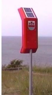
Figure 2 (left). PV powered emergency phones at North coast of Sealand (Copenhagen Telephone Company, built 1997).