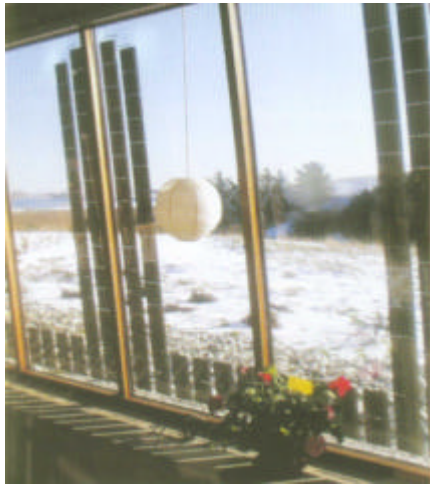
Figure 6. Window integrated c-Si and m-Si solar cells at Skibstrup conference building (Midtglas, Gaia Solar, Peoples Renewable Energy Centre, built 2000)