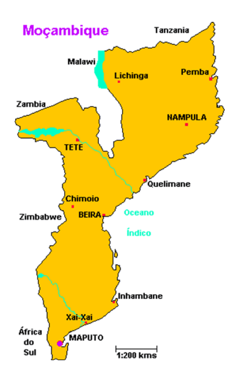
APPENDICES Appendix One – Map of Mozambique