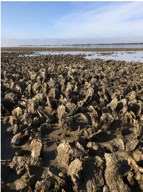
Fig. 1. Biogenic reef of the Pacific oyster Magallana gigas.