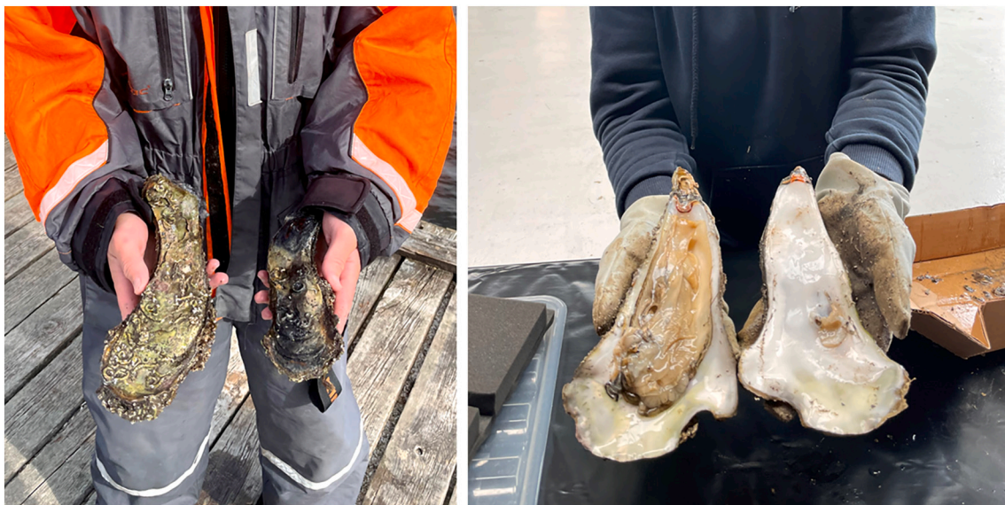
Fig. 2. Individual Pacific oyster Magallana gigas shells (left) and soft parts (right)