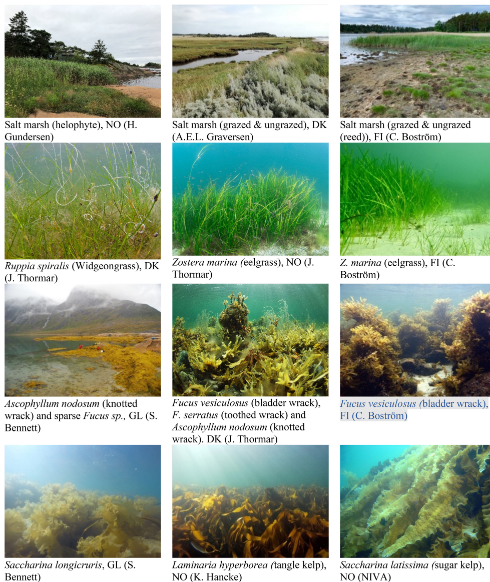
FIGURE 1 | Examples of characteristic Nordic BC habitats: Salt marsh (1 st panel), rooted vegetation such as seagrass (2 nd panel), intertidal macroalgae (3 rd panel), and submerged macroalgae, such as kelp forests (4 th panel).

particularly Fucus species dominating the shallow/tidal zone and Laminaria - and Saccharina -dominated kelp forests ( Figure 1 ) with understory vegetation being abundant in the marine subtidal (e.g. Fredriksen et al., 2005).