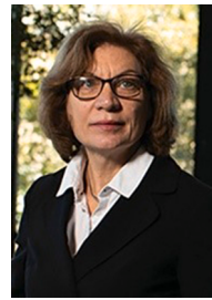
Queensland University of Technology and University of Maryland at College Park.