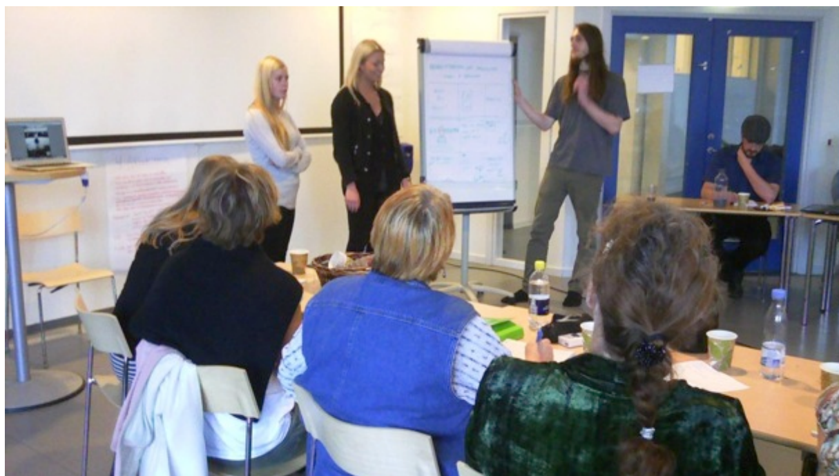
Image 5: students present their first prototypes to the various stakeholders in the project. They get feedback through collective reflection for the next iteration.

We teachers pre-arranged feedback sessions and the student work groups arranged meetings with other NGOs and representatives of volunteer organizations in order to test the initial design ideas and first prototypes. Groups were asked to collectively reflect on the (partly contradictory) feedback they got in relation to their idea, and renegotiate how the feedback would require them to adjust their design idea. Their design objects thus turned into socio-material public entities that were exposed to functional diversity and thereby invited controversies and renegotiations throughout the entire process. This process was also supported by the target stakeholders' explicit feedback and input.