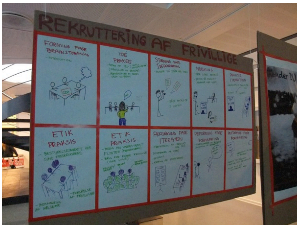
Image 1: Example of one of the design project's storyboards describing the design process involving meeting with different stakeholders and renegotiating the aim and purpose of the design idea. The storyboard is a designer's working tool to visualize the different phases of the design process. In this case it illustrates a recruitment campaign for volunteers and psychologically vulnerable people asking for social support.

that social anxiety would prevent peers from participating in social gatherings despite the fact that they very much would like to. It was also new to them that extreme obsession with one's own physical appearance could result in spending many hours in front of the mirror prior to a social event and even yield the result that someone would decide not to go out at all. It was also new to them that people with depressive periods would not necessarily be able to formulate their need for social contact. These kinds of distributed problems that emerged as a result from co-exploring functionings and capabilities set the scene for the students' potential design ideas. The group then began to draw mind-maps, write post-its, create storyboards (see image 1) etc., illustrating their initial thoughts on how they themselves and people close to them could also be understood as holding a stake in the phenomenon of psychological vulnerability.