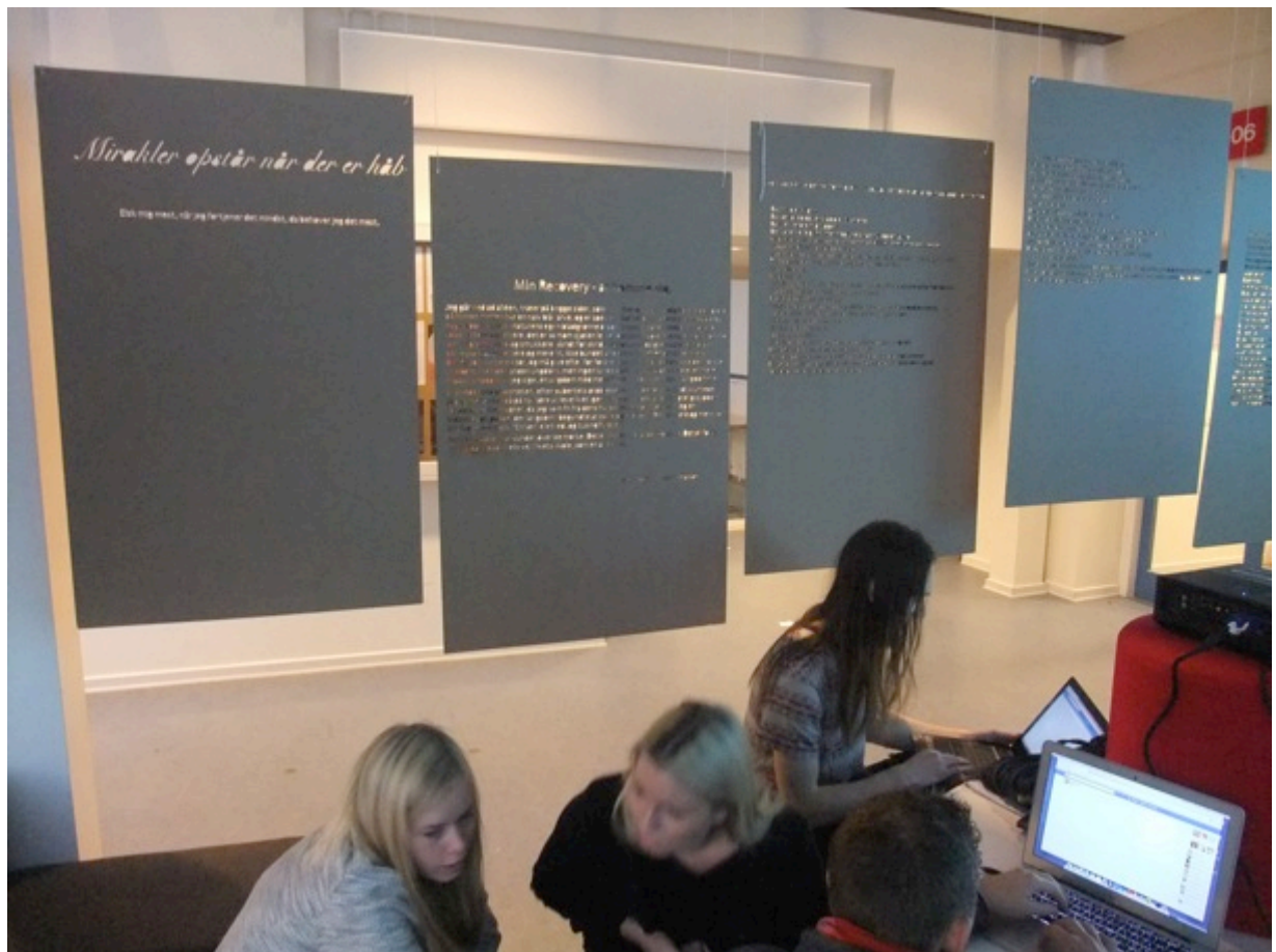
Image 6: Laser-cut cardboard elements displaying one of the stakeholder's poems – an idea initiated by the students as background to the study programme's showcase.

A number of so-called psychologically vulnerable participants, the initial target group holding the stake, attended the showcase and expressed their enthusiasm. One of these participants even gave permission to the students, upon their initiative, to transform poems she had written and presented to them earlier in the workshop into laser-cut cardboard elements (see image 6), which set the frame for the workshop's showcase by granting the visitors insight into artistically transformed experiences of being considered a psychologically vulnerable stakeholder.