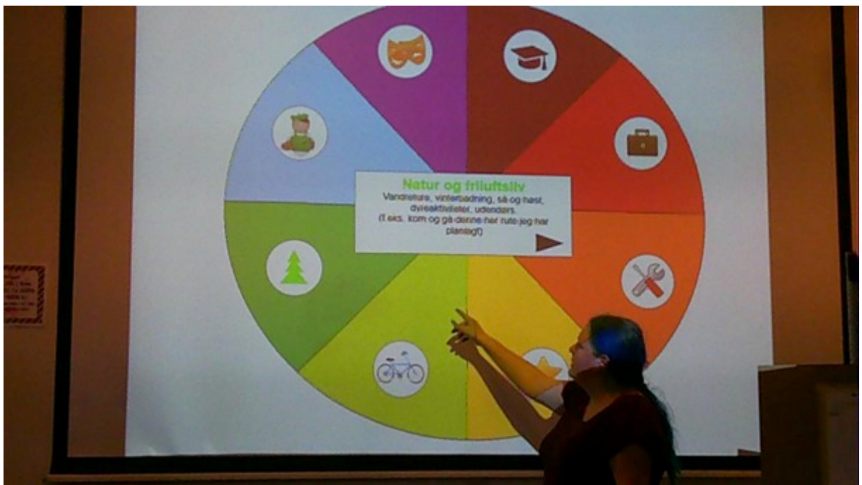
Images 3 and 4: students present their prototypes, in this case a visualization of an activity calendar via which volunteers and psychologically vulnerable people can meet around social activities.