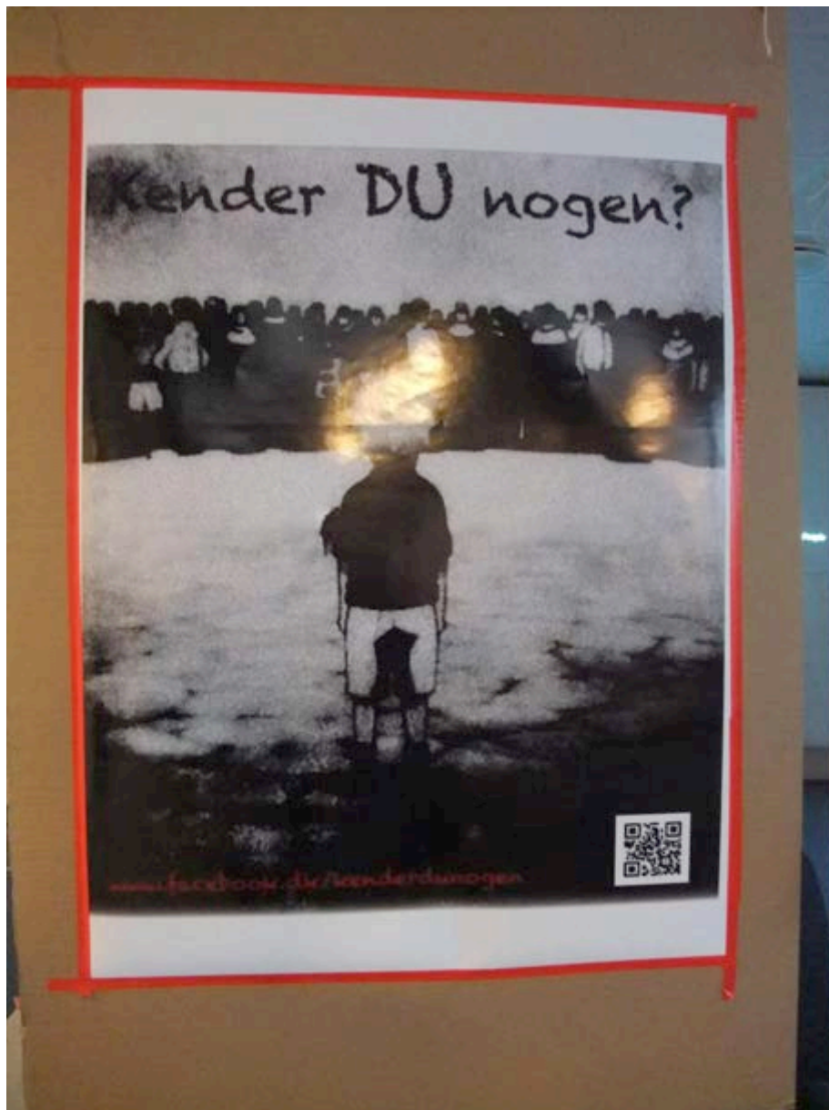
Image 2: Volunteer recruitment campaign logo prototyped by the students.