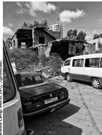
Shatila Camp. Beirut 2017.

The tour ends at the same place as where the group started, and after a solidarity-hug with Ahed, the bus is filled up and a somewhat silent group returns back to base. This will take some time to digest. Ahed's questions of “What will you then say to your government when you get home?” and “Why have you forgotten us?” will remain unanswered in the minds of the participants for the next couple of days.