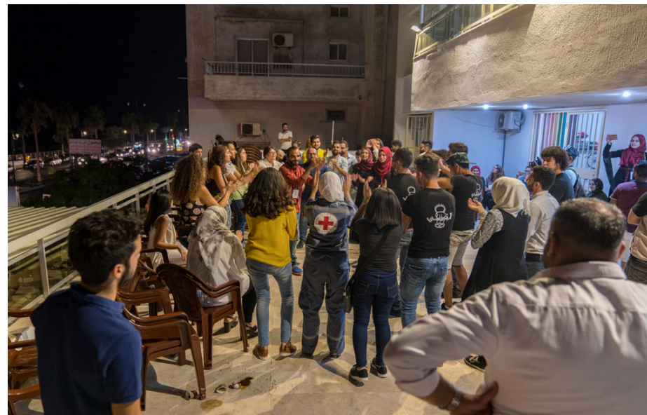
Bussma Youth Center, Saidon, 2017.

Instead of positioning them as “traumatised”, “refugees”, etc. such categories are avoided