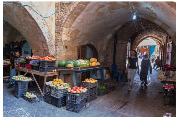
Souk in Saidon 2017

Special thanks to everyone involved for your time, positive energy, and dedication to this project and to the Danish Arab Partnership Programme – Fund for Academic Cooperation and Exchange between Denmark and the Arab world for funding and making this experience possible.