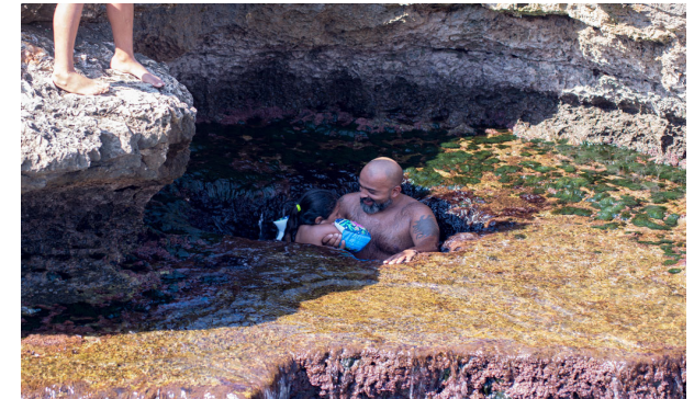
Family life, The Corniche, Beirut 2017, photo: cphsoclub

It is a new approach to get to know their families in a more direct form of contact in order to ensure the best intervention. Contact with the family can, from this perspective, be regarded as a specific way of connecting them to their cultural “compass” (norms and values).