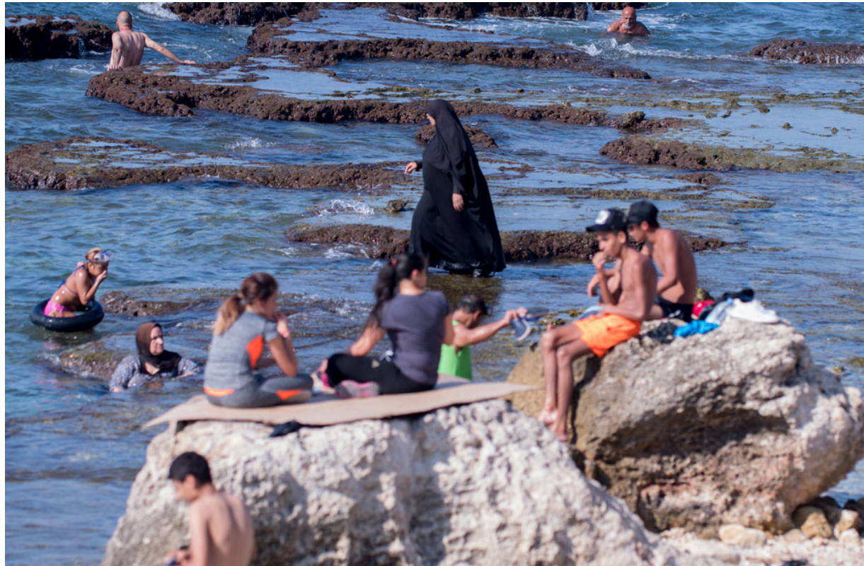
The Corniche, Beirut 2017, photo: cphsoclub.

set up meetings with the social worker, etc. In particular, this applies to cases where there is a need for “damage control.”