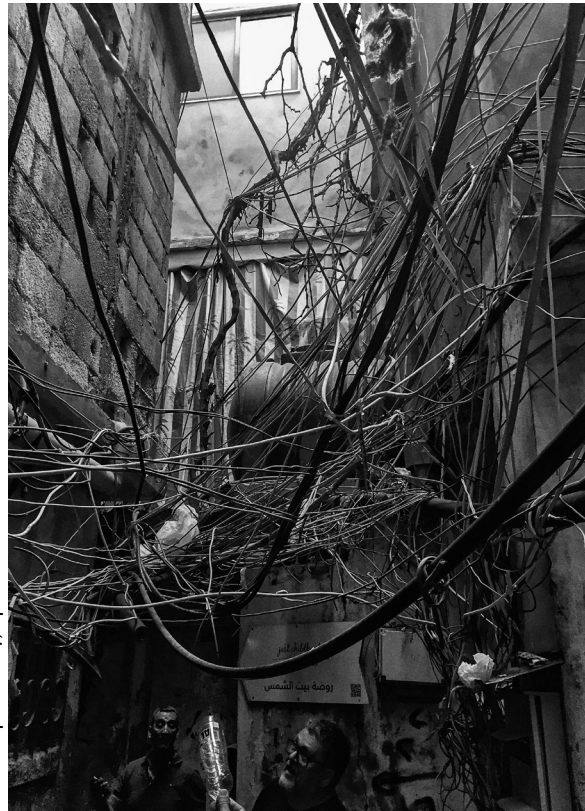
Shatila Camp. Beirut 2017.