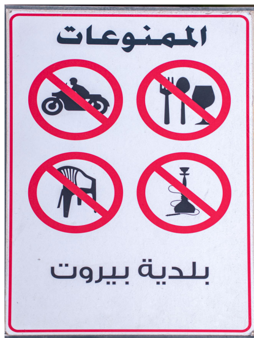
Streetsign, The Corniche, Beirut, 2017, photo; cphsoclub

All photos are provided by cphsoclub, and were taken during March and August 2017, in Byblos, Beirut and Saidon. Photo page 14, courtesy Reuters. All video material is provided by DPNA in Saidon