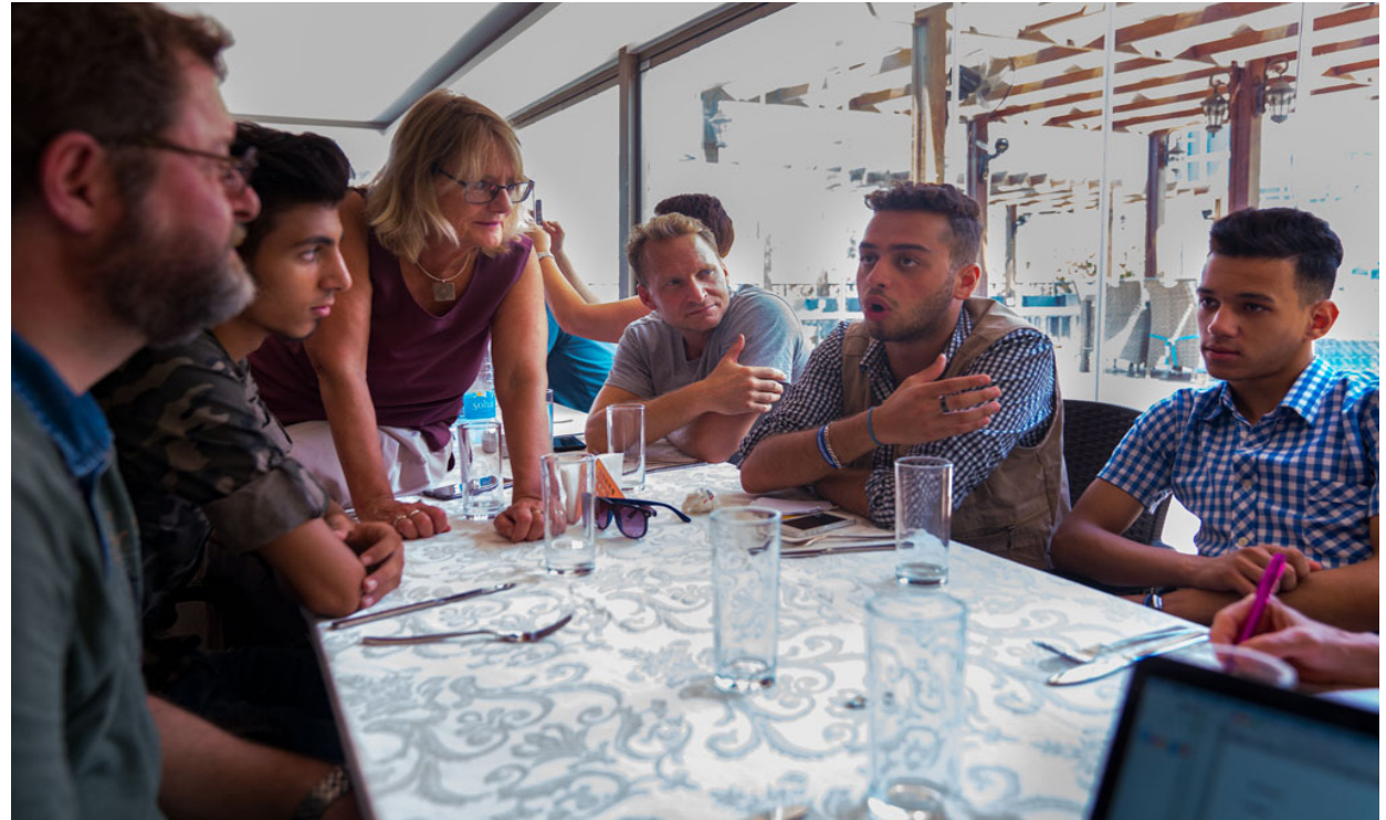
Intense group work, Seidon 2017

Once we met up with our partners in DPNA,