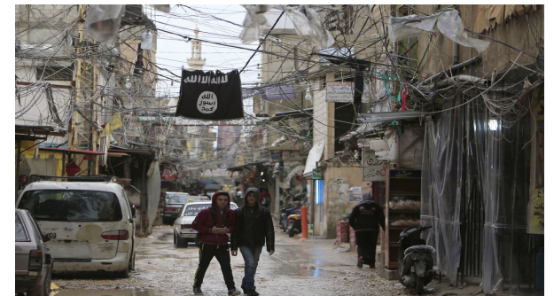
Ain al-Hilweh.

Bussma is also available to kids and young people from the Ain al-Hilweh camp, which is frequently subject to regular battles between warring Palestinian fractions - often with fatal outcomes.