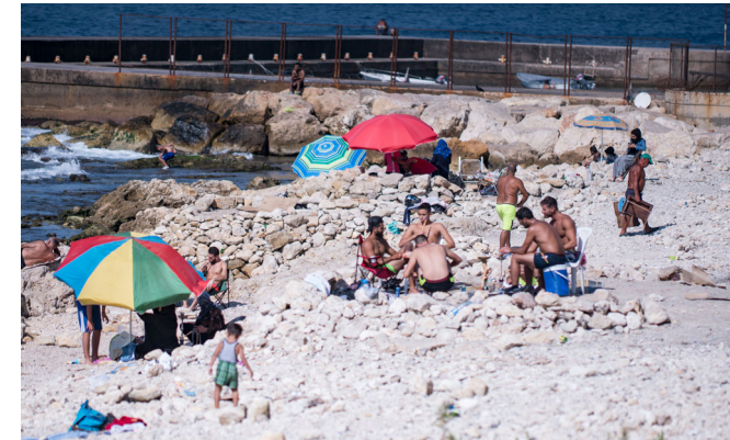
Family unity, The Corniche- Beirut, 2017, photo: cphsoclub.

The field work revolved around the deconstructed family and its significance on the young people's ability to cope with their own circumstances. It quickly became clear to all participants that the significance of the family, while known, was being underestimated in their daily work. By focusing on the absence of the head of the family, the participants were given insight into the significance of growing up in a "weak state" where one's needs were met by the family, the network and through relationships in the local community - and not by the public sector.