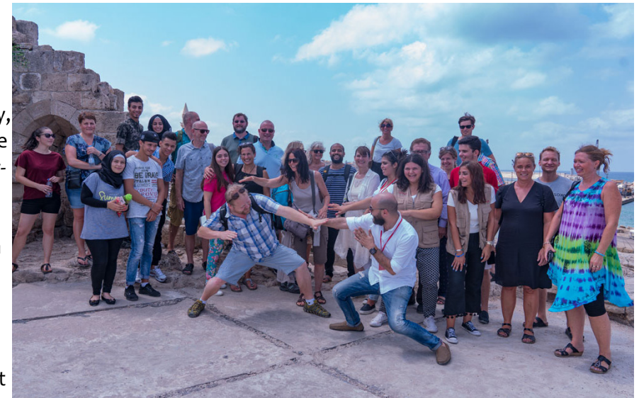
Volunteer youth from DPNA and the Danish group, Saidon 2017.

One of the experiences that the participants were faced with in their field work was the energy involved in the initiatives that our partner NGOs presented. The air quivered and was electrified by the commitment, energy and