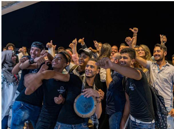
Volunteer youth, Bussma Y.C., Seidon 2017

The house is maintained by a permanent staff consisting of a centre coordinator and his/her assistant, an assistant teacher, a permanent project evaluator and two psychologists, in addition to two technical and administrative staff that handle the bookkeeping and secretariat functions. The psychologists are clinically trained and work with the young people either directly or indirectly.