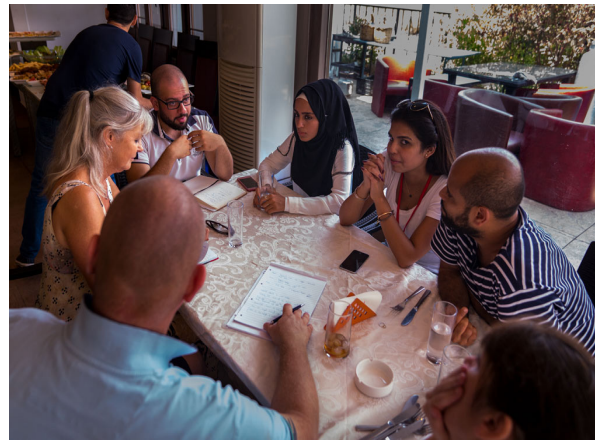
Groupwork, Seidon 2017, photo: cphsoclub.

Dignity is a central value of great importance, and creates a cultural discourse that is crucial in working with young people. It is often men-