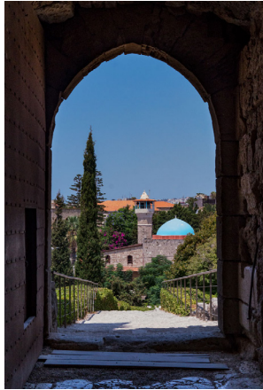
Byblos 2017, photo: cphsoclub.

On the 11th August 2017, together with Bent S E Hansen, I embarked on a preparatory fieldtrip to Beirut. Two days later, we received 19 social/case workers, psychologists and pedagogues from across 5 different Danish municipalities as well as the Red