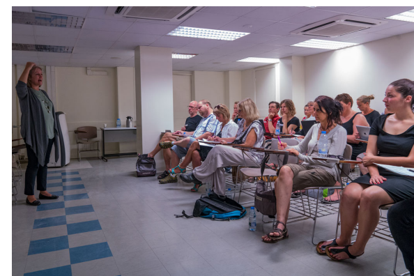
Lecture at LAU. Beirut 2017

The project encourages actors to investigate and (possibly) work towards the opportunity for more exchanges between the young people’s “homeland” and Danish institutions.