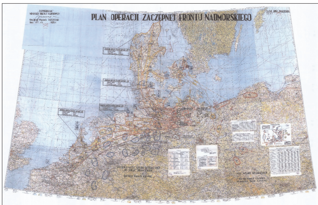
Figure 1. Plan of an Offensive Operation of the Coastal Front. The heading is quite clear, as well as the authorization of Defence Minister Jaruzelski (top left) on 25 February 1970. Classified as Tajne Spec Znaczenia, equivalent to NATO Cosmic Top Secret, the base map seems to be composed of a number of 1:500.000 map sheets, made by the Polish General Staff and based on Soviet maps.

The map itself is designed in a dramatic design language, with large red arrows pouring out of the right-hand, eastern, part of the map, cutting across Western Europe, unstoppable by forests, rivers and other natural obstacles and unaffected by major cities and political lines of division.