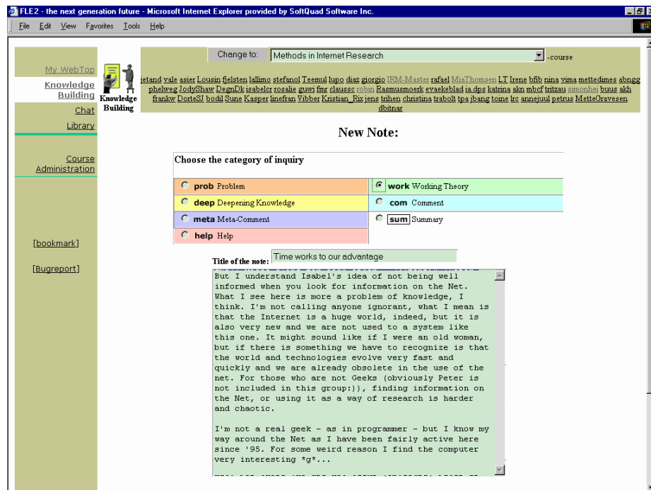
Figure 2: FLE2 Create New Note window showing the categories of inquiry.

However, in the course in question we did not adhere strictly to the FLE2 pedagogy, nor did we use the system quite as intended by its creators. FLE2 is a groupware system meant to supplement face-to-face classroom work. We used it as a conferencing and collaborative work tool in what has been primarily a distance education course. For this kind of use FLE2 is not optimal. Having to rely almost entirely on electronic contact between students and between students and instructors, and running a rather tight schedule we deemed it necessary to present the students with the themes to be discussed rather than letting them create their own research problems and working theories.