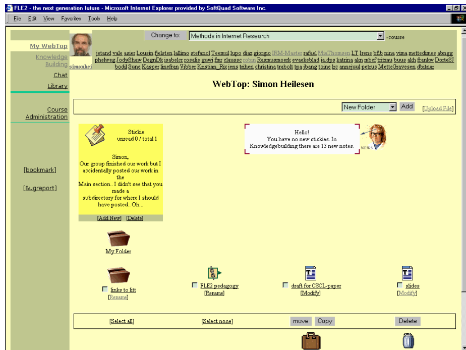
Figure 1: Future Learning Environment 2 WebTop.

The Knowledge Building Environment (figure 3) has been designed to support the special FLE2 pedagogy consisting of problem based learning (PBL) and inquiry learning (described in Muukkonen, Hakkarainen & Leinonen 2000). Thus there are several categories of folders (Course, Announcement, Course Context, Starting problem), and there is an elaborate system to label all contributions according to their role in the evolving discussion (Problem, Working theory, Deepening knowledge, Comment, Meta-comment, Summary, Help, see figure 2). As it turned out, the system of labels was not very helpful in making complicated threads of discussions easily understandable. A functional problem, since corrected, often caused the students to use the default label if they were not careful. Furthermore, the use of the labels had not been taught sufficiently well at the introduction to the system, nor did the instructors insist that they be used properly. In addition to these rather technical explanations, the labels also seem to offer a conceptual problem in that it is not possible to match the seven labels and the eight stages of FLE2 pedagogy (Setting up the Context, Presenting Research Problems, Creating Working