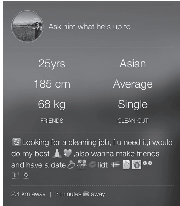
Figure 14.1 This recent immigrant squeezed an announcement seeking a job, friends, and a date into one short Grindr profile. (Printed with permission from user.)

in exchange for housing and thus for financial support. Like the Grindr post cited at the end of this chapter's first paragraph, these ads blurred their announcements for 'friends, dates, work'.