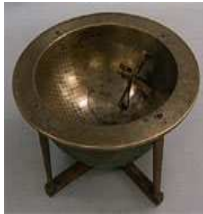
Figure 8: Chinese Skaphe [R17]

A skaphe also called bowl sundial. It is made for particular latitude.