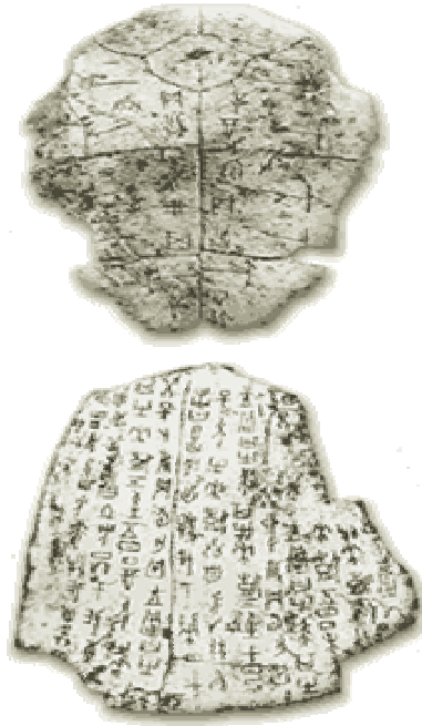
Figure 3 [R14]

was divided by few countries, and each country had their own calendar which based on the old Chinese calendar.