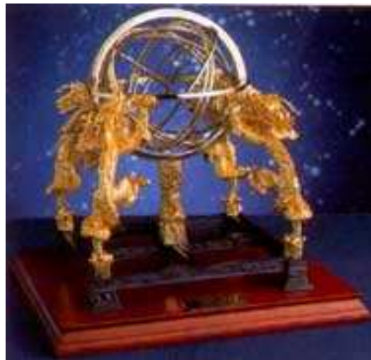
Figure 7: Hun Tian Yi [17]

The "celestial sphere instrument," the armillary sphere appeared more than 2000 years ago in China. This tool was used by Astronomers to determine coordinates for celestial bodies and to learn how the astronomical principles. It connected to a machine run automatically by the water, and move exactly as the solar system. The first one was made in 117 by Zhang heng (one of the famous astronomers in China)