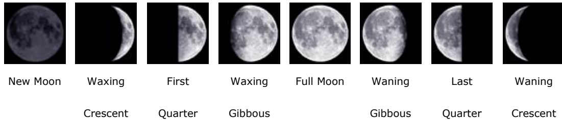
Figure 1 [R7]

back dark (New moon), when human observed the moon from the earth. This is a cycle from New moon to Full moon and back to next New moon. (See Figure)