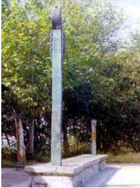
Figure 4: “Biao” and “Gui” [R17]

Observes after over a long period of time, the our forefathers not merely comprehend the 11 a.m. to 1 p.m. cousin-hour's image of a day is the shortest at high noon time, but also obtains the inside the summer solstice--the 10th of the 24 solar terms day of 1 year, the high noon “Biao” image is the shortest in a year; the high noon image is the longest in a year when the day is winter solstice day coming.