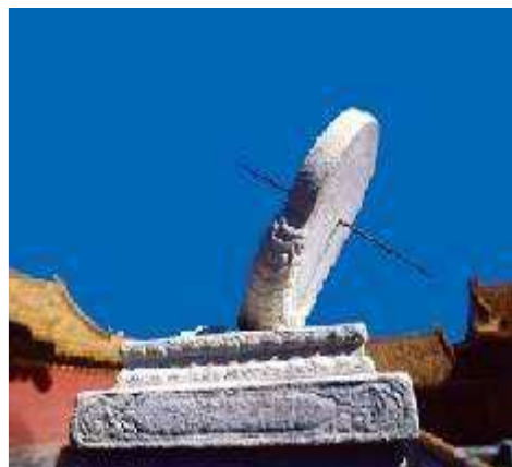
Figure 5: sundial [R17]

needle”, vertically passes the disc heart, and is role as “Biao” action. So the sundial needle is called “Biao” once more, the disc is known as " the surface of sundial " , places at stone on stage , and presents that northern is lower and southern is higher, and causes the sundial parallel to the sky equatorial plane. The surface of sundial is divided into 12 great squares and the internal angle is 30 degree. Every one great squares formed by crossed lines stands for two hours. When the sunlight illuminates the sundial on, the sundial needle reflection is able to fling to the sundial surface, and when the sun moves from east to westward, flings to the sundial surface of the sundial needle reflection also slowly through western eastward removing such as the moving reflection of the sundial needle is the indicators of watch and the sundial piece is the timepiece faces, with this comes to display a point of time.