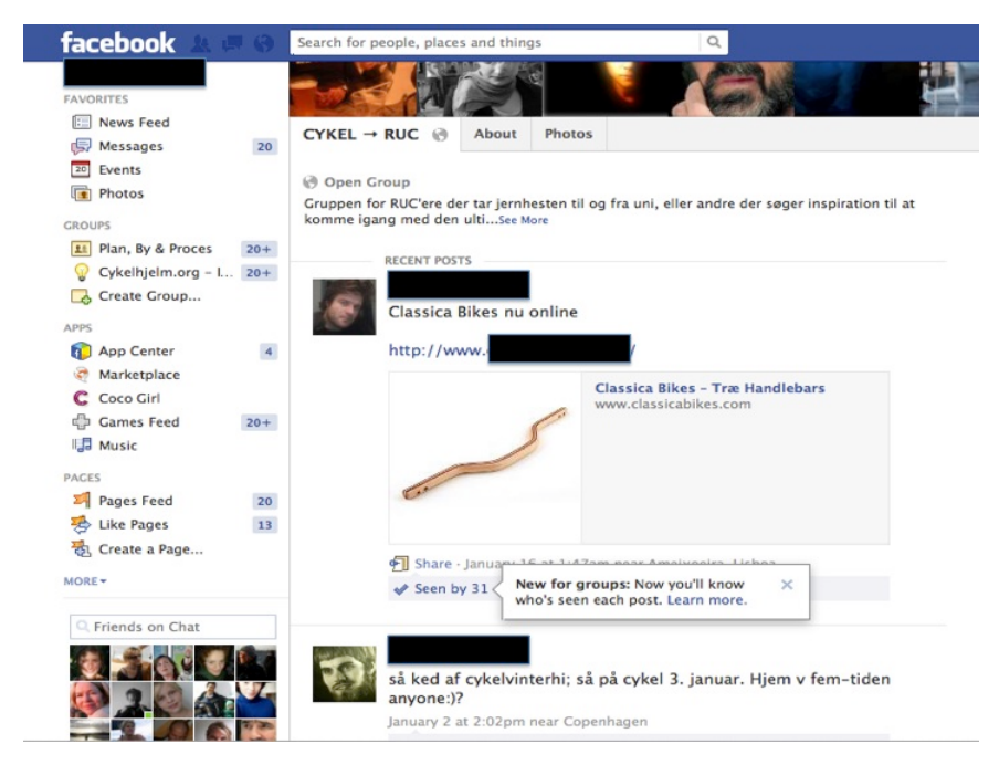
Figure 1: Commuter's post to RUC Cycling Facebook Site.

Bauman might describe this Facebook site as an example of conviviality (Bauman in Thomsen, 2013) rather than community. It could be used to demonstrate Staeheli and Mitchell's (2006) argument that communities are false publics: spaces where sociability is claimed, but ordered and facilitated through security, familiarity, identity, control, and lacking in the randomness, chance, and confrontation with difference that characterizes a true public sphere. In this view, modern communities such as this are another articulation of individualization and separation. I think this is an incomplete understanding. It is true that Roskilde's cycling Facebook community is exclusive, for example in the way it relates to long distance commuters working or studying at Roskilde University. However, its users are quite dissimilar in many regards, ranging from speedy commuters in Lycra on racers, to slow movers on traditional bikes wearing everyday clothes. Moreover, Roskilde University does not have the same kind of websites for car or train commuters, which the majority of staff and students are. A strong cycling 'we' is created through this site, because it serves a minority mobility group at the university, enabling their face-to-face contacts and friendships, as well as nurturing a sense of belonging to a new movement (compare with Aldred's (2013) discussion of English cycling blogs, which are used primarily to complain about poor cycling infrastructure).