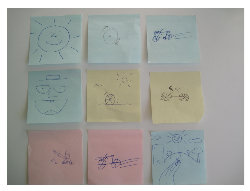
Figure 3: Examples of Post-It notes drawn by BIL Bike Library borrowers