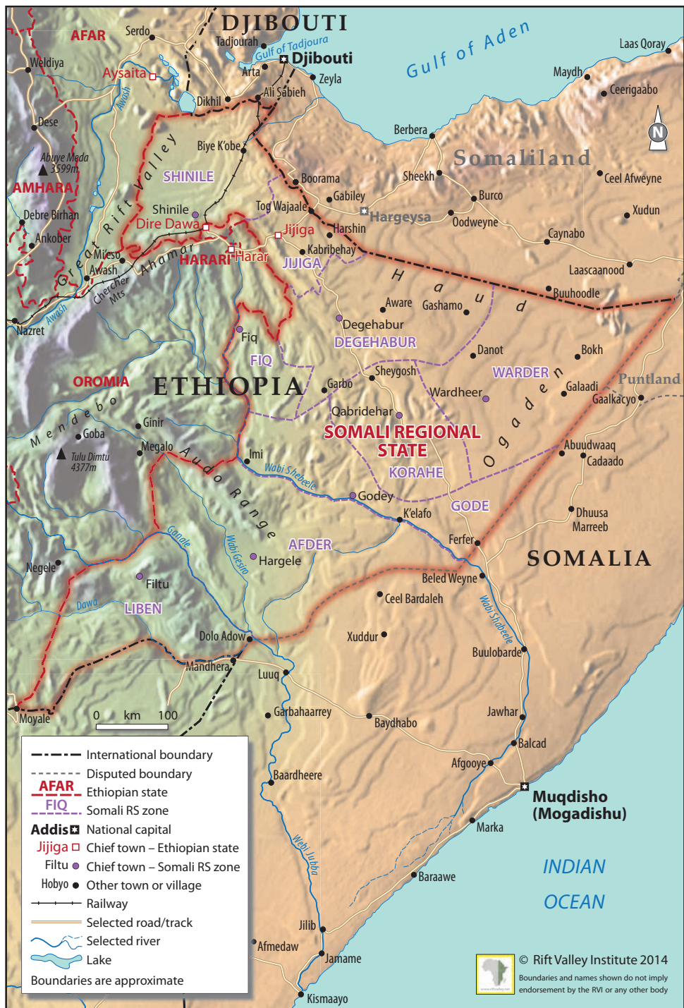
Map 2. The Somali Regional State in Ethiopia