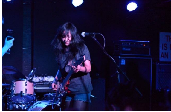
Figure 1 (Left) A sidewalk view of The Bowery by Think Coffee, one of the popular establishments in this area of the gentrified Lower East Side. Think Coffee is a gourmet mini chain concentrated in Greenwich Village, and this shop opened in 2008. Figure 2 (Right) One of the many Brooklyn baby bands in action at Mercury Lounge