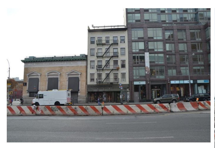
Figures 3-4. Street views on Houston Street show how Mercury Lounge is dwarfed by The Ludlow, one of the major high-rises on the Lower East Side. The Ludlow opened in 2007.