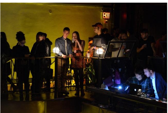
Figure 9 (Left). Intimacy in the lounge bar of The Bowery Ballroom. Figure 10 (Right) Intimacy in the balcony