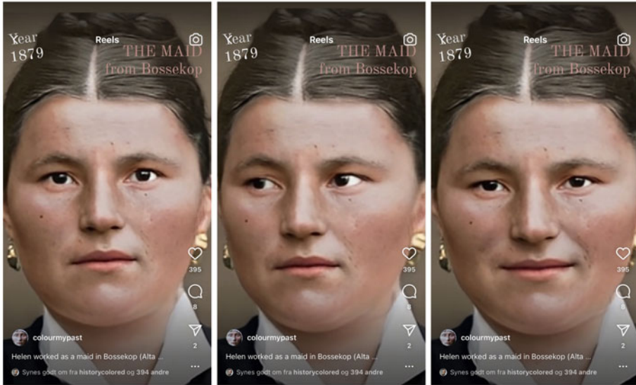
Figure 4. Stills from an animation of ‘Portrait of a young woman’, an original photo by Mantegazza and Sommier colourised and AI-animated by Somby.

Somby’s creative experiment with various digital tools could be seen as an attempt at a reparative reading of the portrayal of the young woman (Hirsch 2012, 24). Although her exact identity remains unknown, Somby’s multimodal aesthetic strategies in this short video reindividualised the portrait. He renamed her with a Sámi name and reclaimed the data extracted by the scientists (the photo and description of her eyes and hair) to make her ‘come alive’.